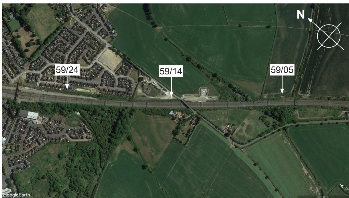
Figure 4: Designated Earthing Point locations