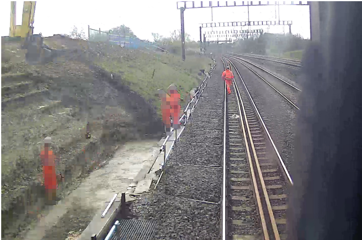
Figure 6: Image from the forward-facing CCTV of train 2N30, immediately before the accident

61 AmcoGiffen subcontracted the isolation and earthing of the ATF system to ISS. The track worker, in his role as COSS/PIC, was required to take line blockages in support of the work and ensure the safety of the staff involved. He had overseen ISS staff implementing these isolations several times in the weeks leading up to the accident.