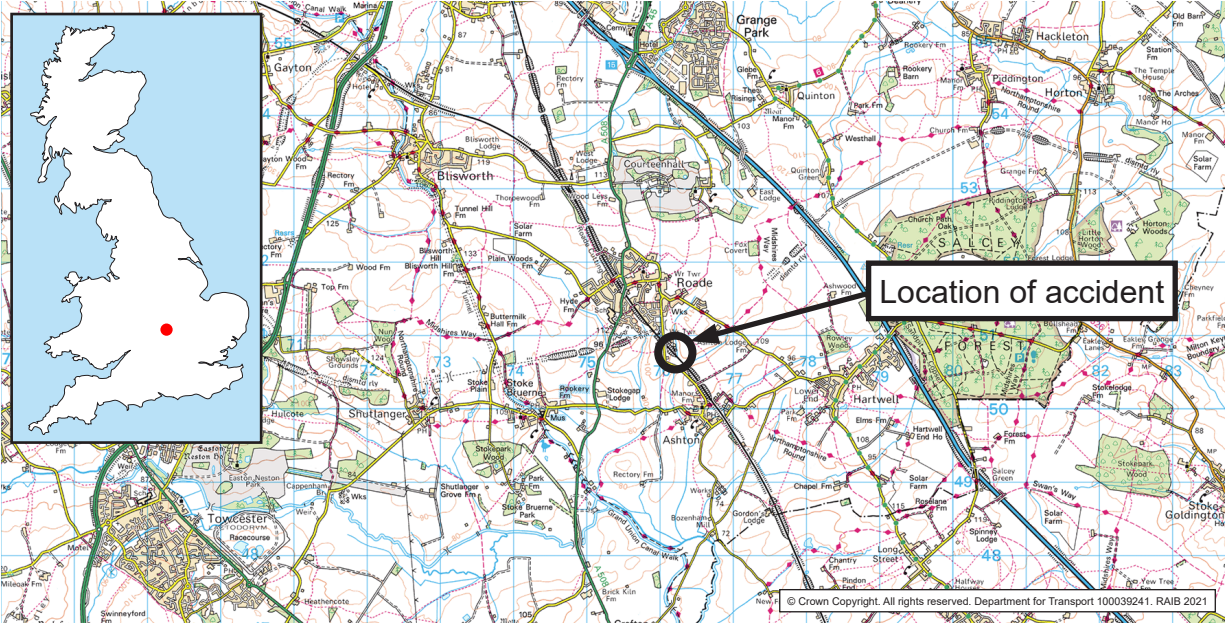
Figure 1: Extract from Ordnance Survey map showing location of accident

3 At around 10:52 hrs on Wednesday 8 April 2020, a track worker was struck and fatally injured by a passenger train on the West Coast main line near the village of Roade, Northamptonshire.