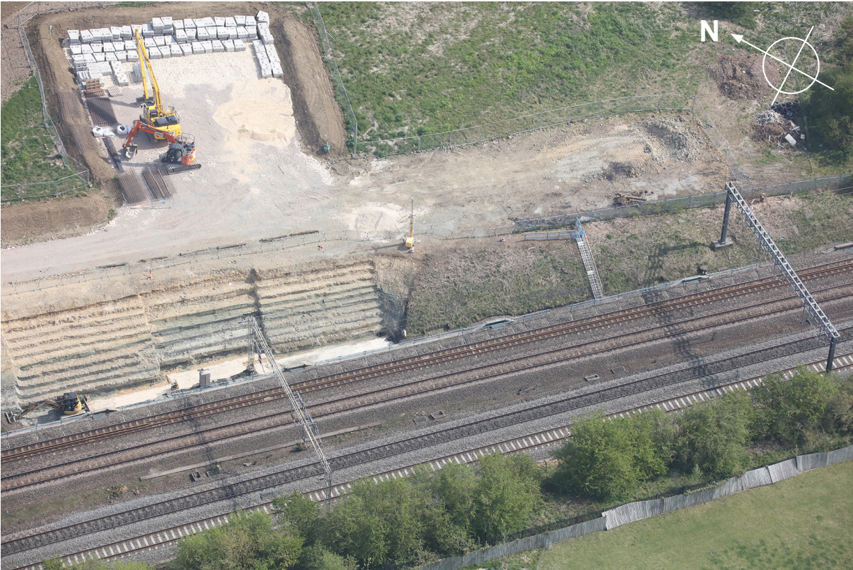
Figure 2: Aerial view of location