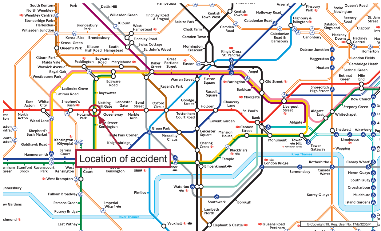
Figure 1: Extract from London Underground map showing location of accident