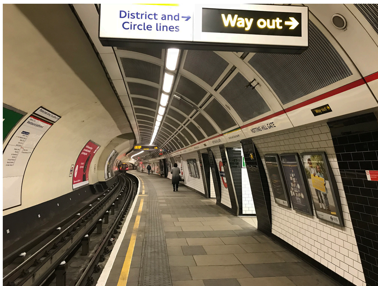
Figure 2: View from the east (tailwall or rear) end of platform 4 at Notting Hill Gate facing west, showing the reverse curve