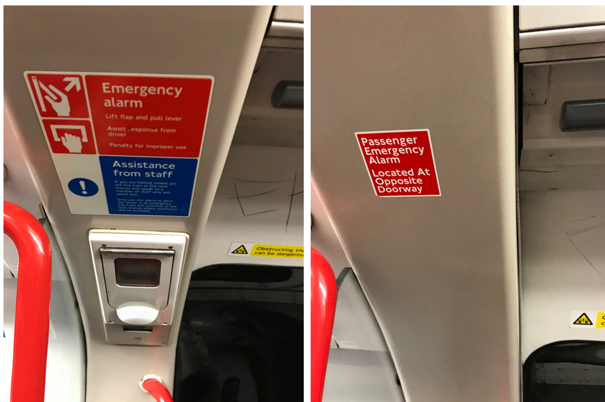
Figure 10: The passenger emergency alarm on 1992 stock (left), and the associated label on the opposite doorway (right). The incident door was fitted with a label, as shown in the right-hand image.

81 On 1992 stock, one passenger emergency alarm (PEA) is provided at each door vestibule, on the pillar to the left of one set of doors. There is a label on the opposite corner stating the location of the PEA (figure 10). The door involved in the accident was one with a label (ie the PEA itself was on the opposite side of the train).