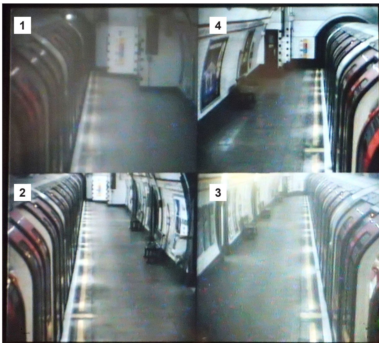
Figure 5: Typical arrangement of in-cab platform CCTV images on the Central line (numbers denote the ordering of images from front to rear of the train)

41 LUL's current standard 6 for in-cab, platform CCTV monitors, sets out specific requirements for a clear view of the complete critical area of the platform-train interface under all conditions at all times. This includes the configuration of cameras, the arrangement of images on the monitor (with no more than four images per display screen) and visibility requirements for the displayed image. The specified optimum viewing angle for a target object shall be at least 54 minutes of arc 7 at the driver's eye point, and shall never be less than 42 minutes of arc (the absolute limit of discernibility is defined in the standard as 20 minutes of arc). The same specified object should occupy at least 13.2% of the screen height for a four-way split screen. However, 1992 stock pre-dates this standard and the standard is not applicable retrospectively. LUL stated that the specification for the in-cab platform CCTV monitors on 1992 stock is no longer available.