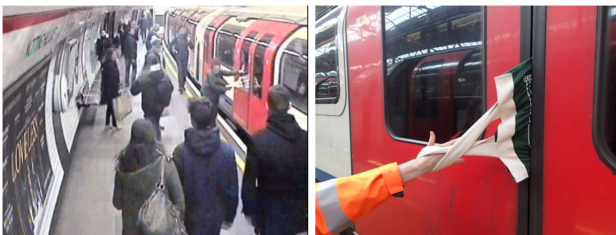
Figure 7: Image from station security camera (left) and RAIB reconstruction (right) showing the bag trapped in the doors