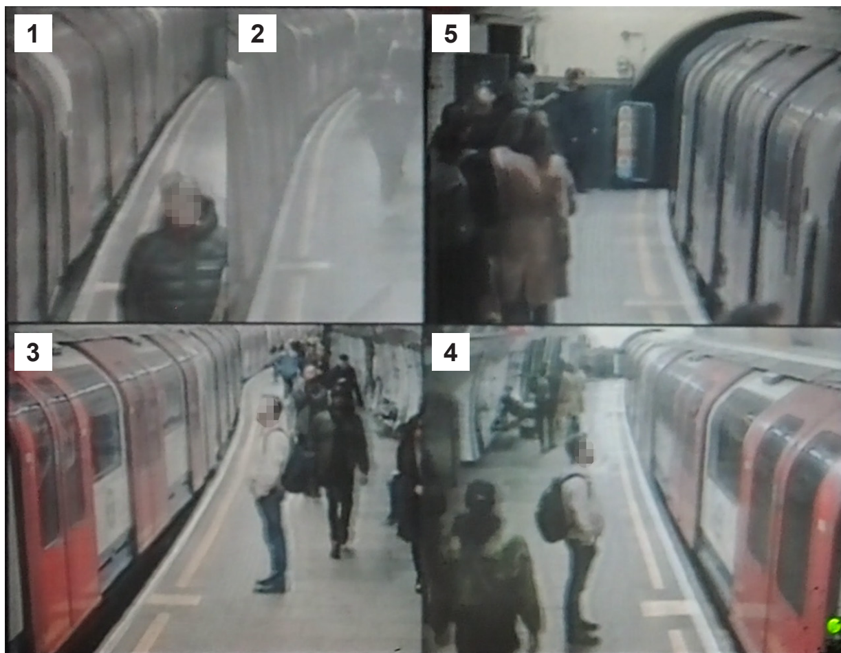
Figure 6: Arrangement of in-cab platform CCTV images at Notting Hill Gate platform 4 (numbers denote the ordering of images from front to rear of the train)