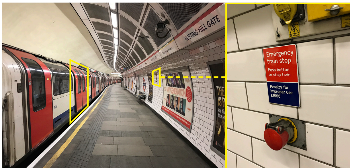
Figure 9: Image of the platform emergency stop plunger (PESP) in relation to the incident door (both highlighted), with a close-up view of the PESP

80 A passenger emergency alarm on the train was activated about 10 seconds after the train started moving.