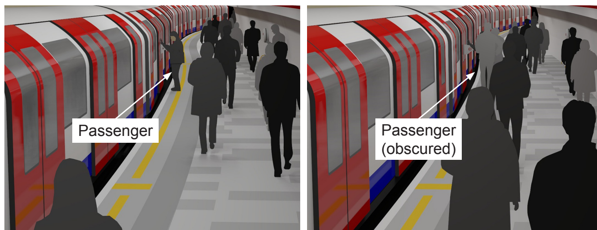
Figure 8: Virtual model of the perspective from the relevant platform-train interface camera showing the view seven seconds before departure (left image) and one second before departure (right image). NB: these represent the image that would have been displayed in the lower-left quadrant of the train operator's in-cab monitor.