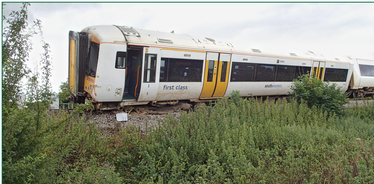
Figure 2: The derailed leading carriage of train 2R66