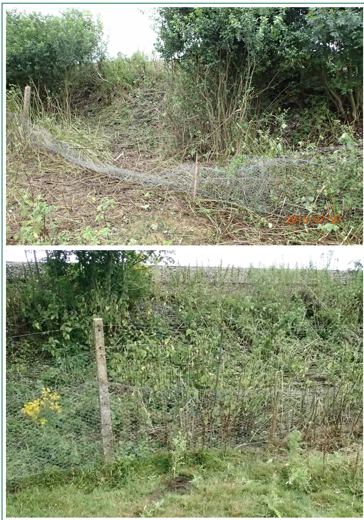
Figure 5: Sections of fence at Godmersham showing the site which was breached by the cows (top) and a representative area approximately 40 metres from the animal incursion (bottom)