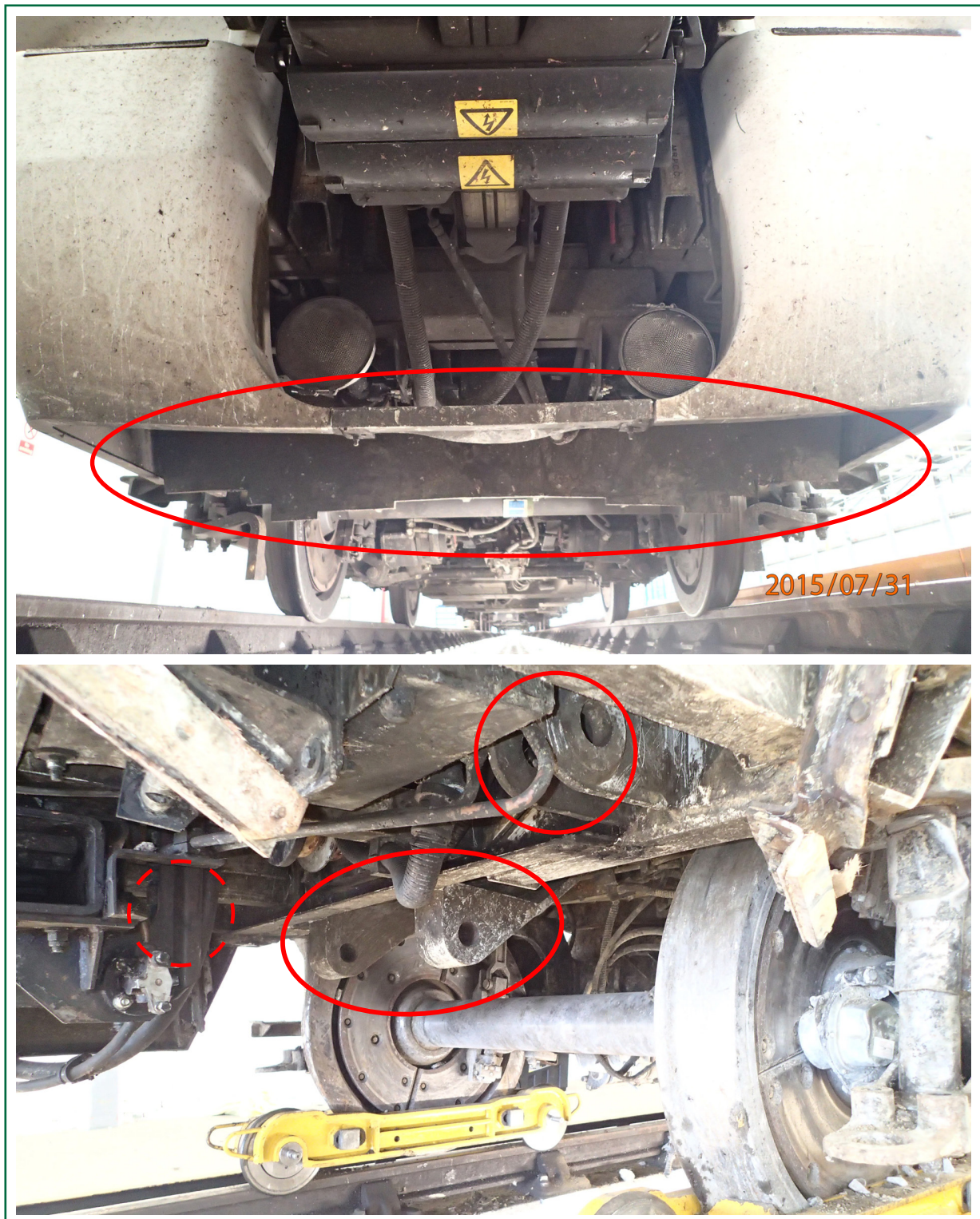
Figure 8: Comparison of the leading end of unit 375612 (top) and the leading end of unit 375703 (bottom), showing the presence or absence of obstacle deflectors respectively (obstacle deflectors and mounting brackets circled in red; one mounting bracket not visible in bottom image). Note that the unit in the bottom image is mounted on wheel skates for recovery purposes.