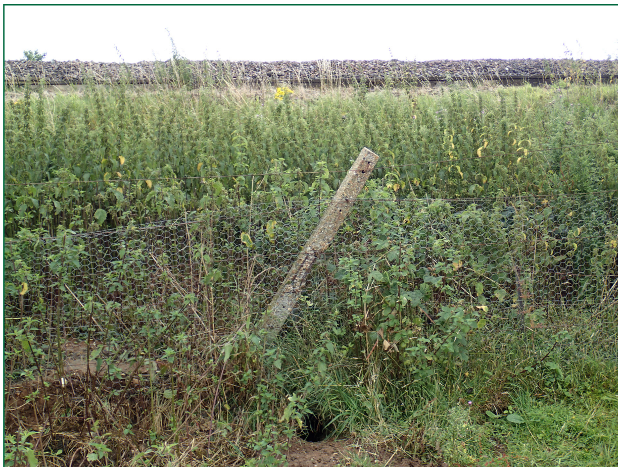
Figure 7: Degraded section of fence at Godmersham (unaffected by the animal incursion)