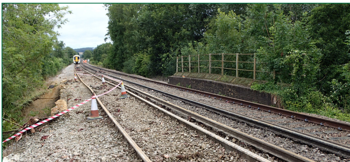
Figure 3: View of damage to the track and bridge as a result of the derailment