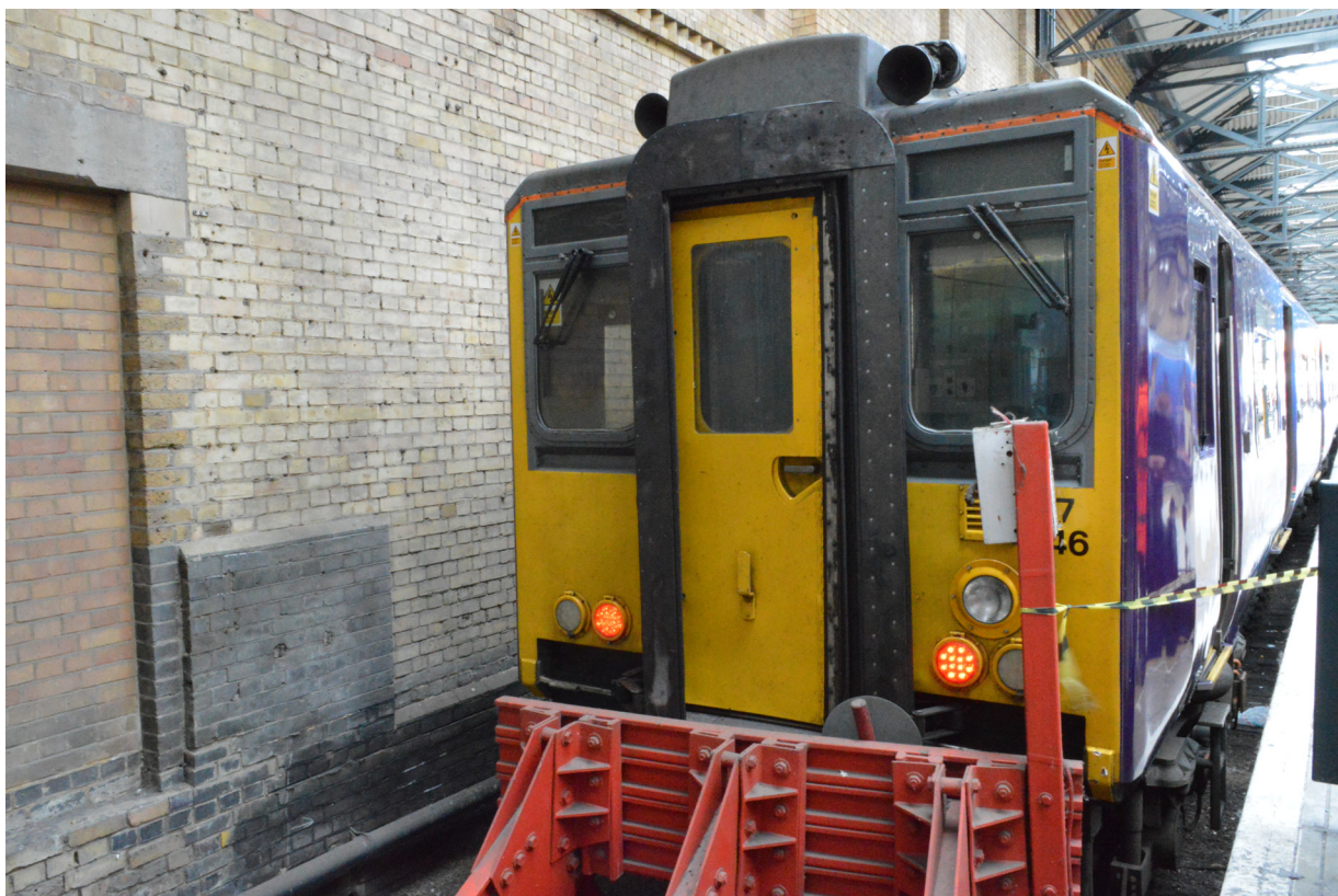
Figure 3: The train and the buffer stops after the accident