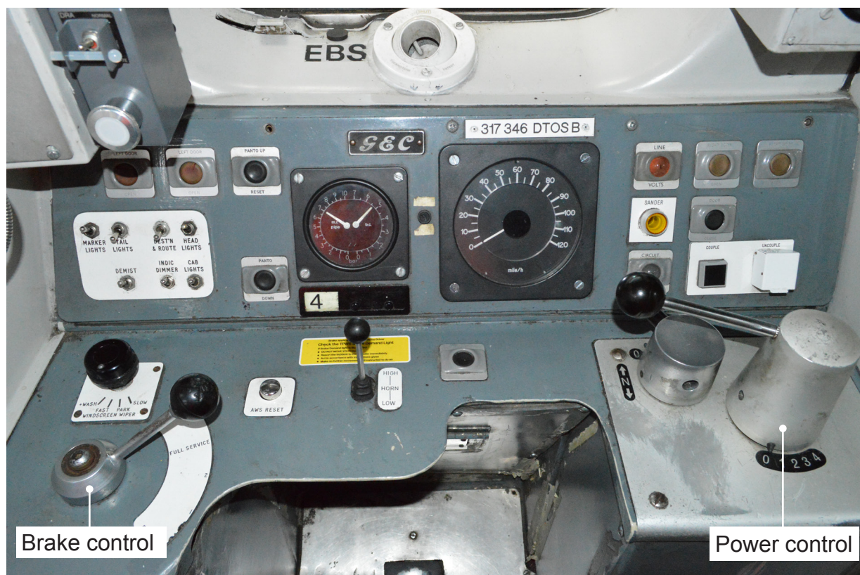
Figure 4: Layout of controls in class 317. The class 313 has a similar layout.