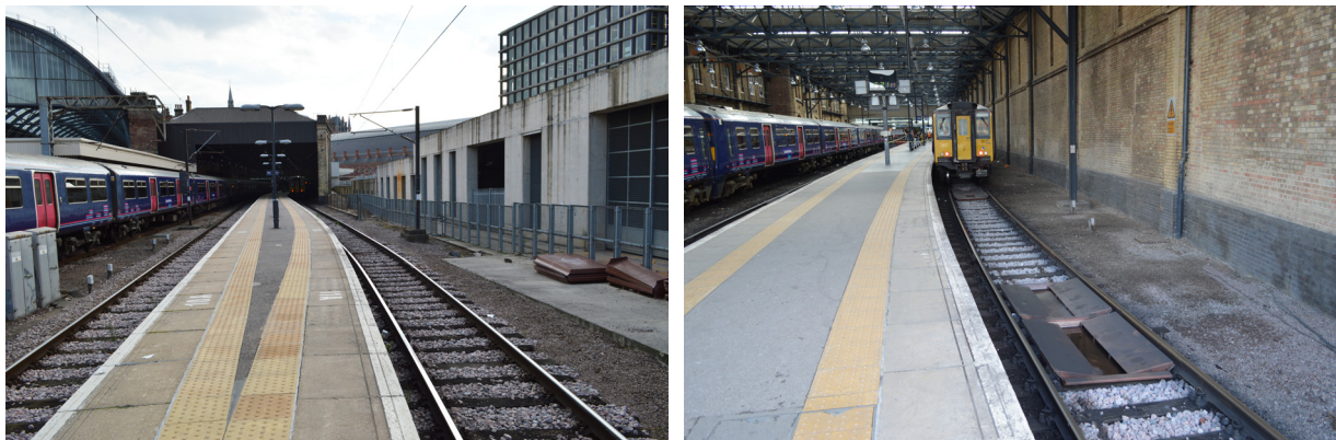
Figure 2: Platform 11 at King's Cross