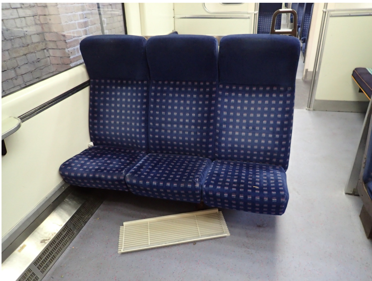
Figure 7: Diffuser on saloon floor following the accident