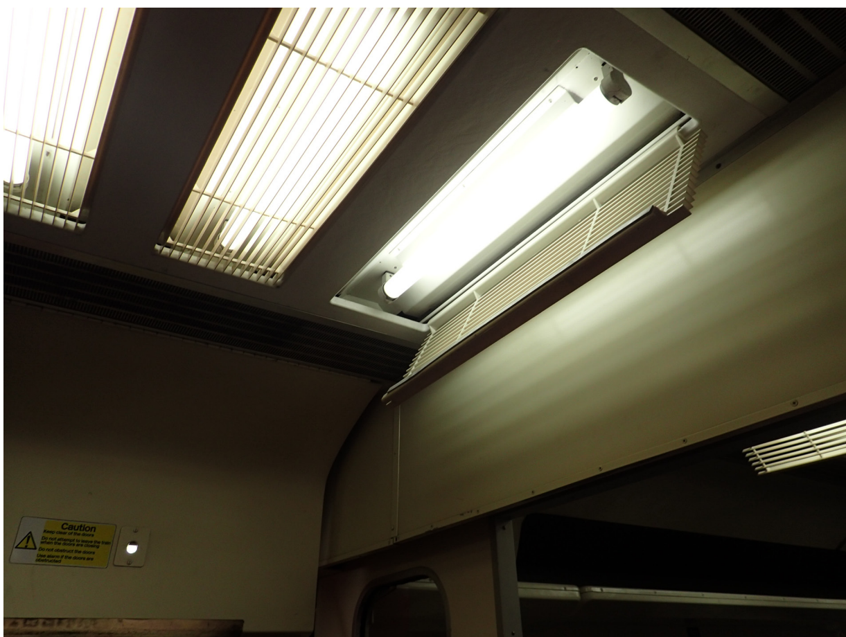
Figure 6: Ceiling of first vehicle, showing displaced lighting diffusers