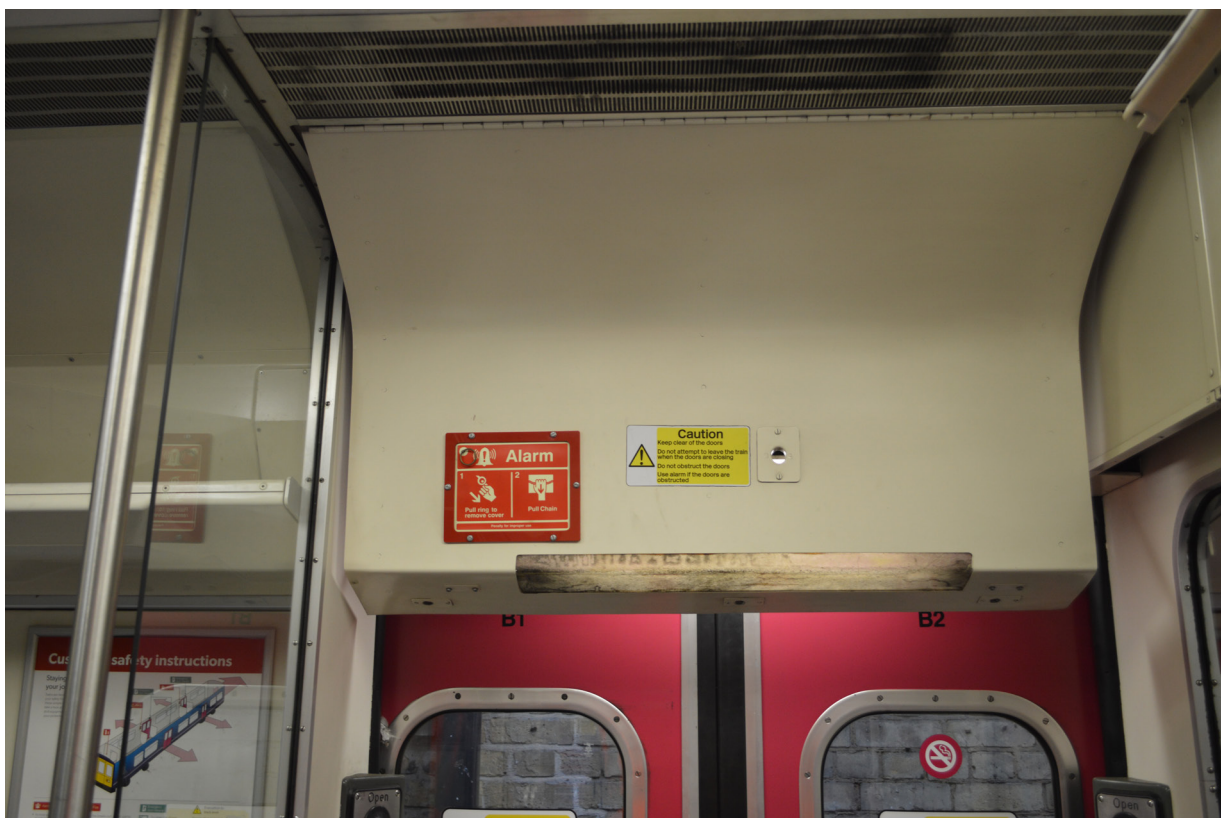
Figure 5: Door header panel, dropped following the accident but restrained by secondary straps (hidden)