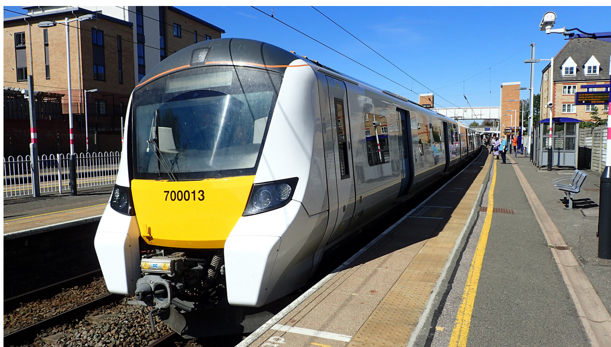
Figure 4: A class 700 EMU of the type involved in the accident