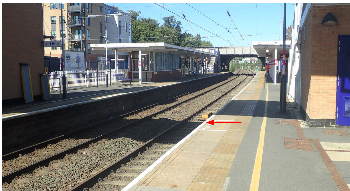
Figure 3: View looking north along platform 1 showing the location of the accident (red arrow)