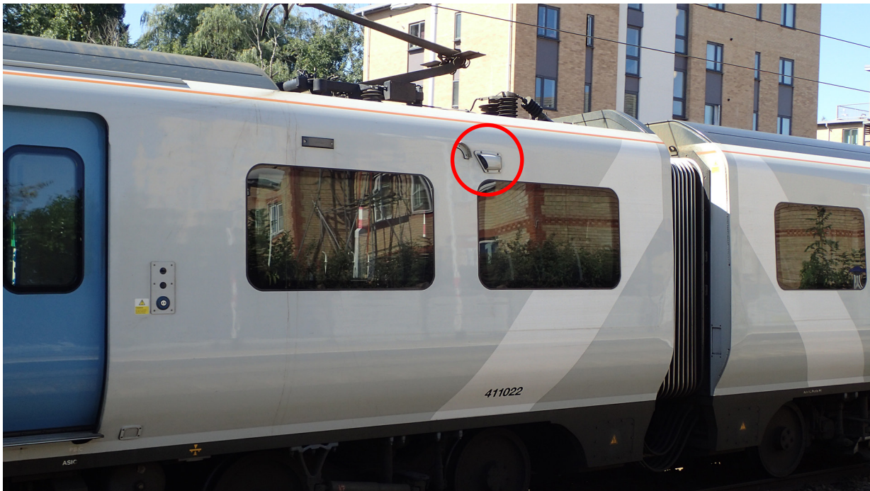
Figure 5: Exterior mounted CCTV camera (circled) on a class 700 coach