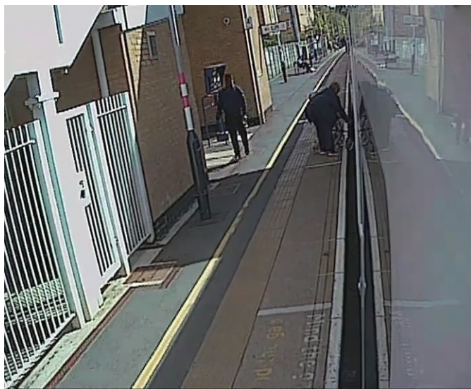
Figure 9: The image of the passenger standing by the train as shown to the driver on the train's CCTV system. The image shown to the driver measured 104 mm horizontally by 87 mm vertically.