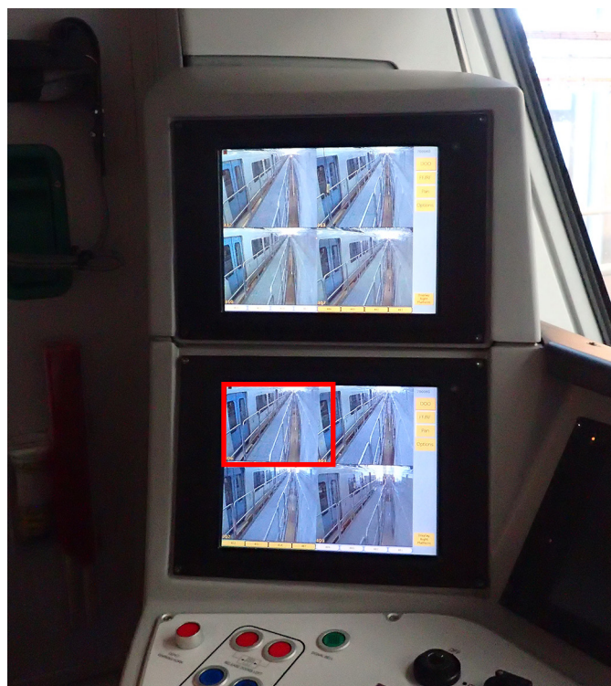
Figure 7: The screens displaying images from the externally mounted CCTV cameras. The red box shows the position of the image showing the fifth coach (involved in the accident). Images shown are not at Elstree and Borehamwood station.