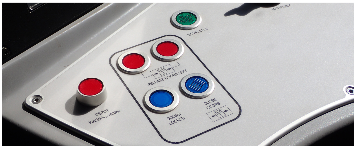
Figure 8: The door controls provided on the cab desk of the class 700 train