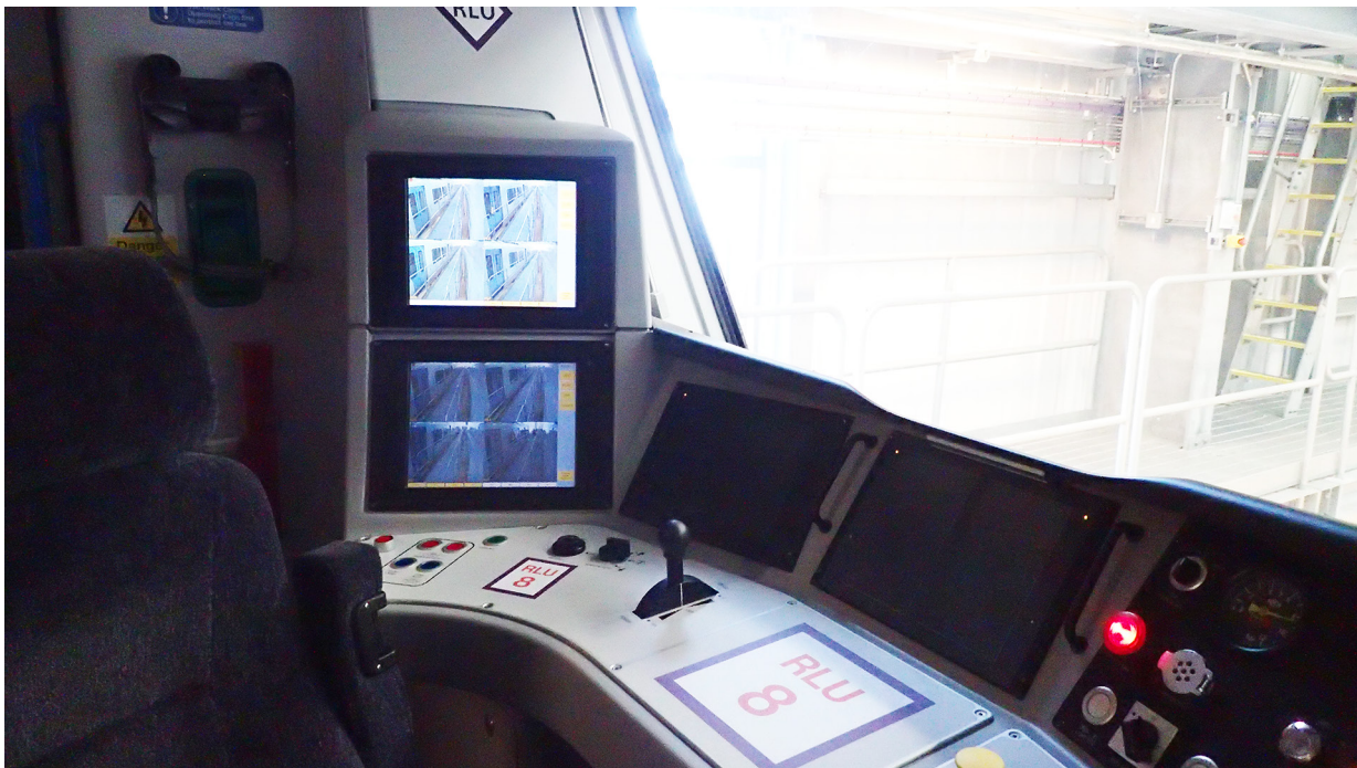
Figure 6: The cab desk of a class 700 train