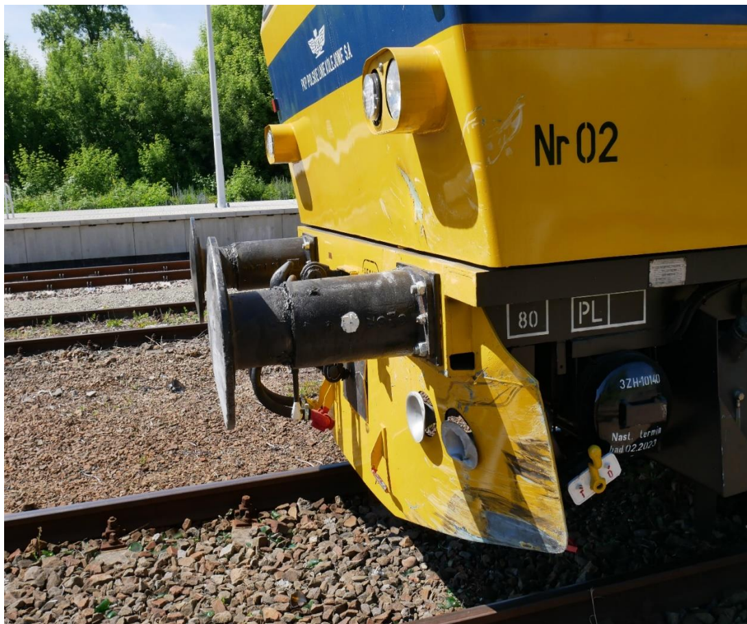
Photograph 6 – Damage of the railway vehicle after the accident