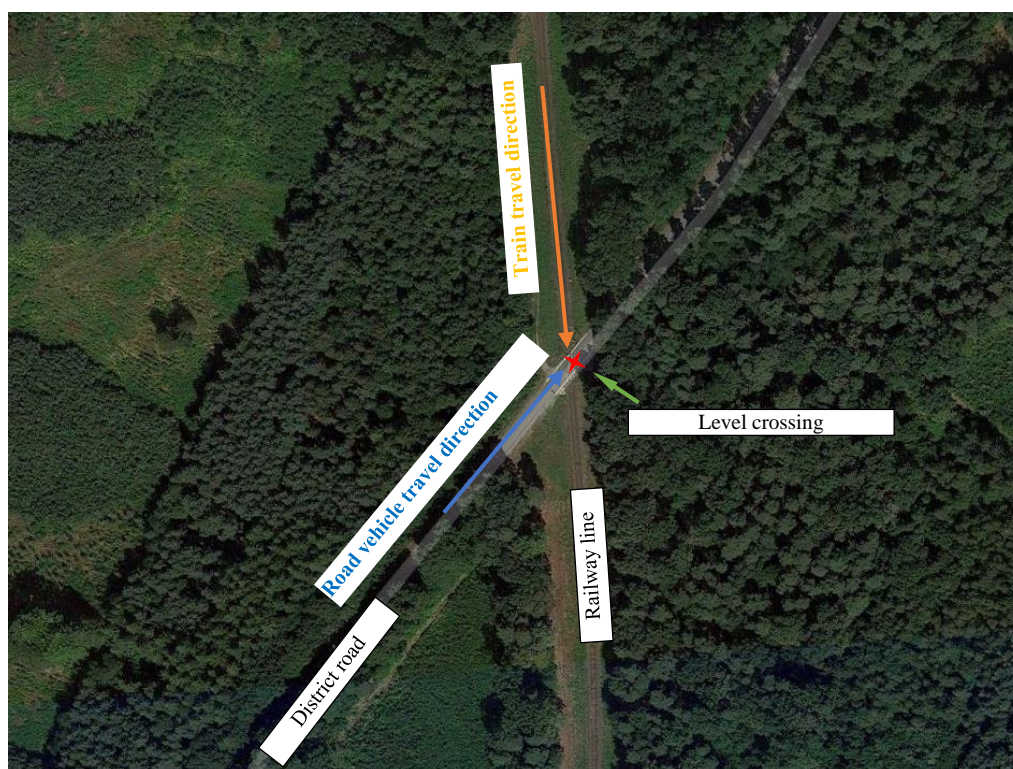
Photograph 5 – General overview of the scene