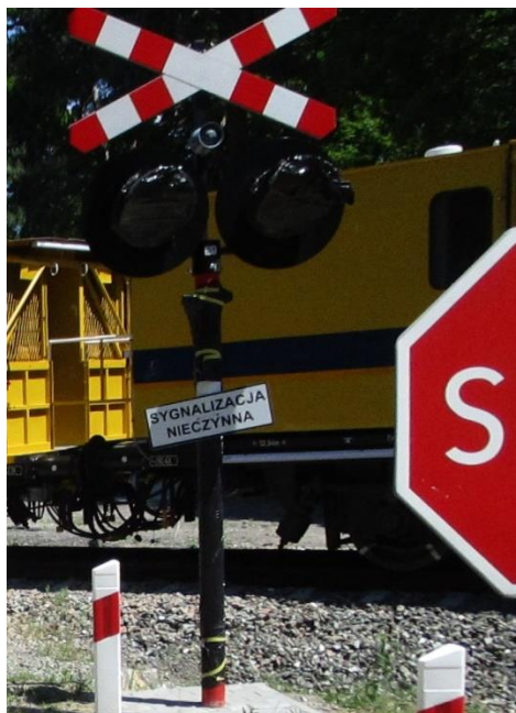
Photograph 7 – “signalling out of order” sign placed on the traffic signal