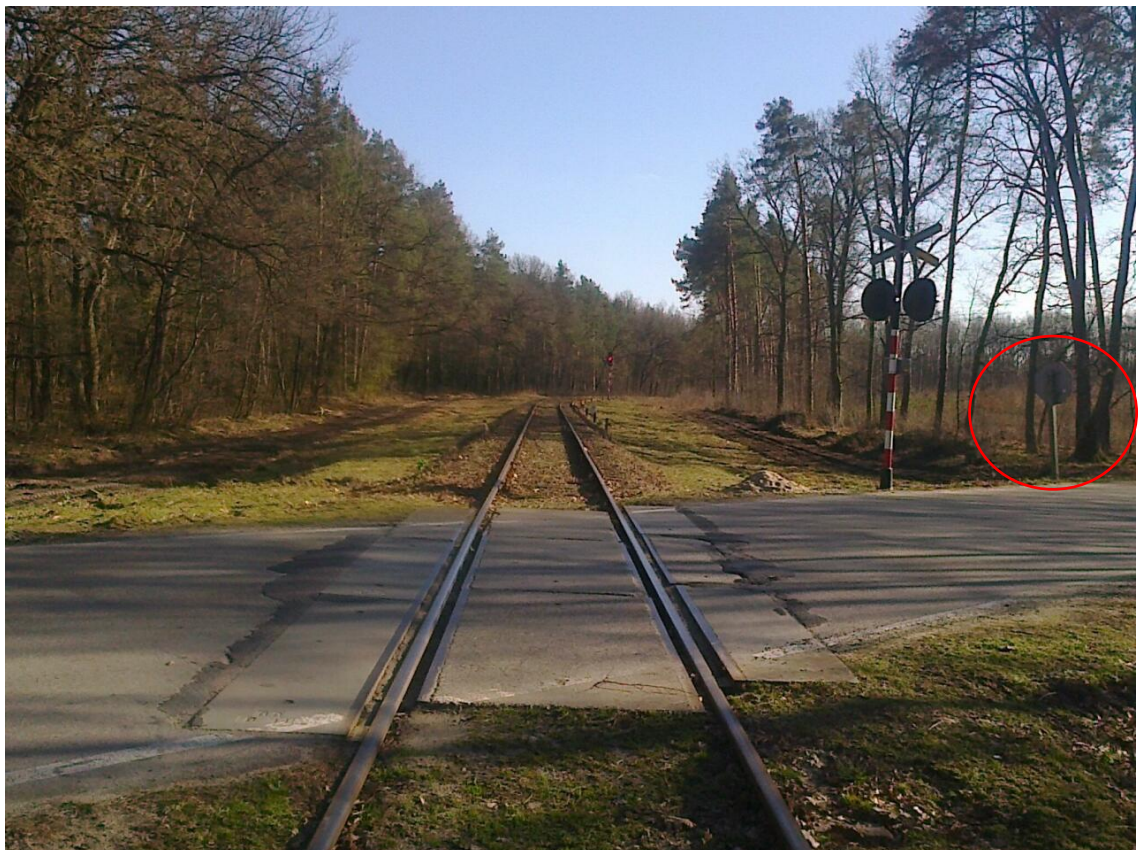
Photograph 4 – View of the crossing prior to revitalisation (27.07.2019)