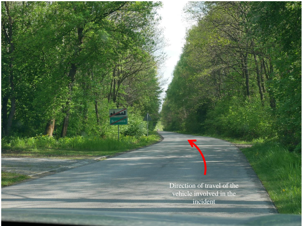
Photo 11 - Road markings in the direction of travel of a car involved in an incident at a level crossing (photo. PKBWK of 09.05.2022)

End of built-up area (50 km/h), start of road in undeveloped area towards the railway/road crossing in question (90 km/h).