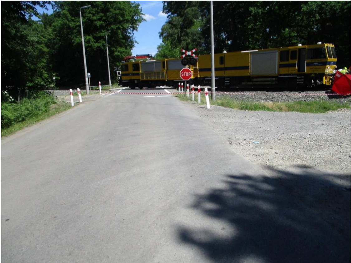
Photograph 3 – Positioning of the motor carriage after the incident (PKP PLK S.A. material)