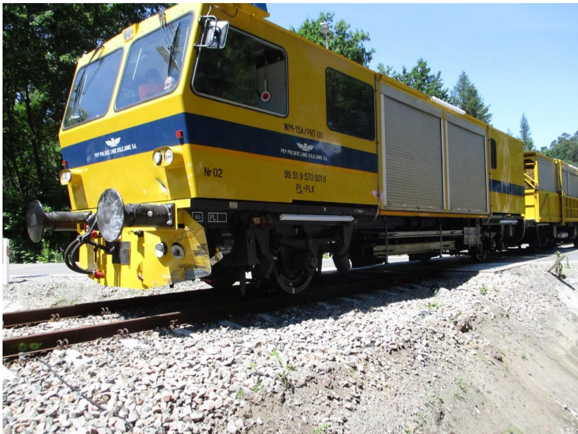
Photograph 2 – Damage to the motor carriage