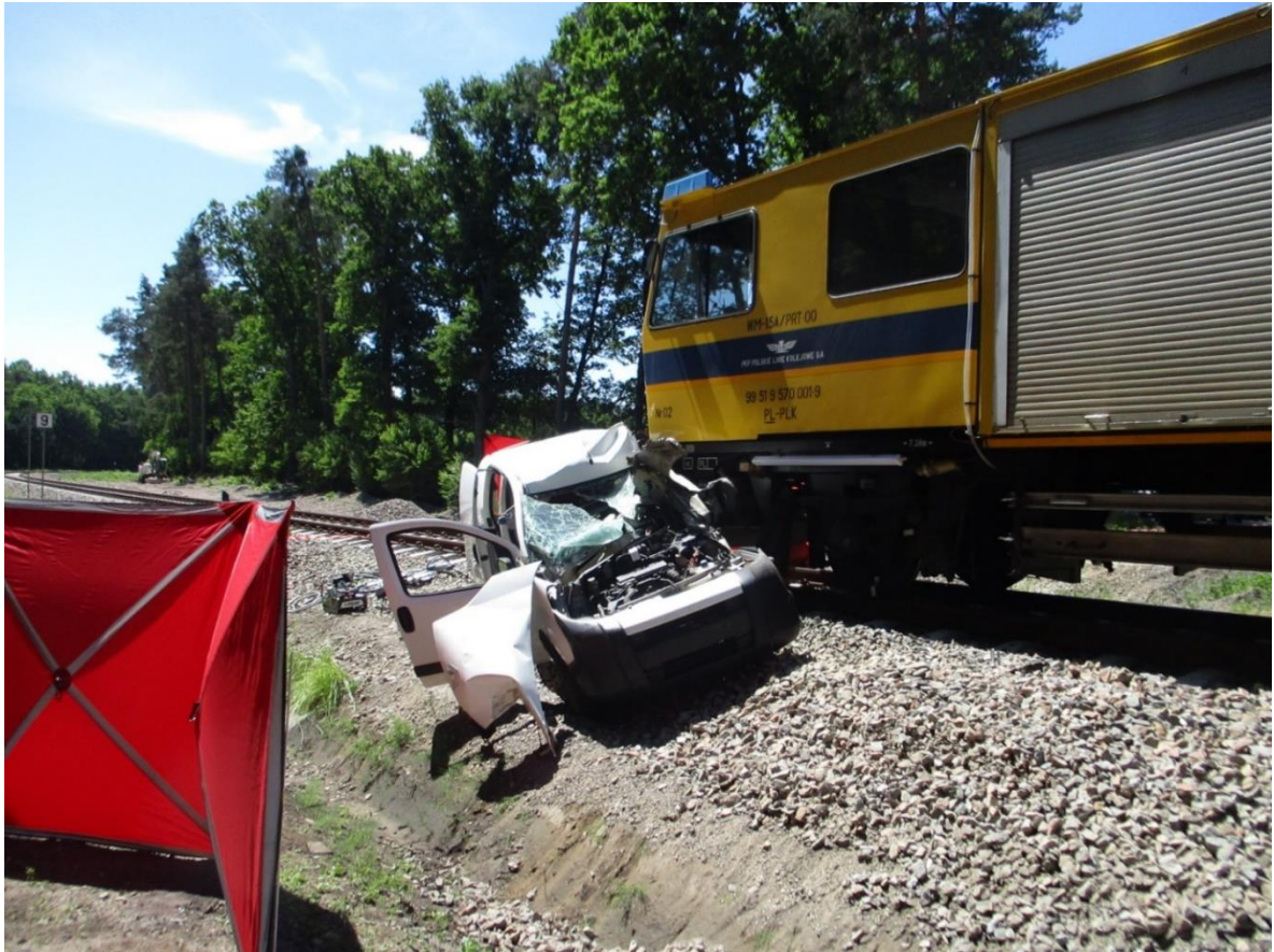
Photograph 1 – Consequences of the Incident