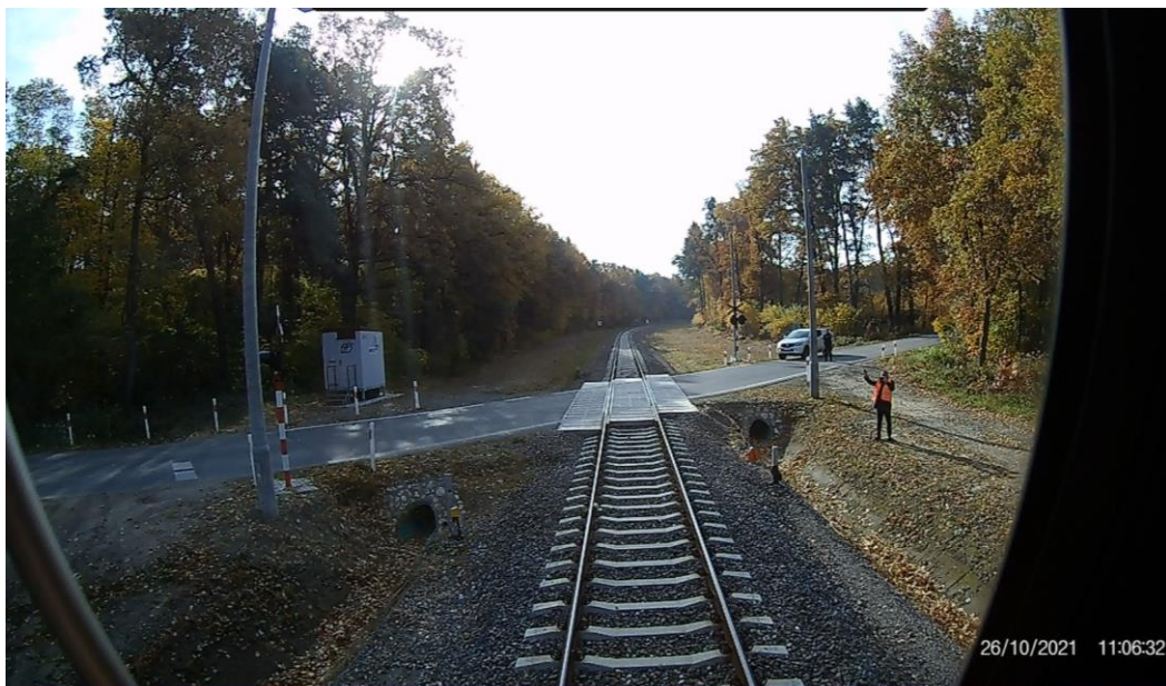
Photograph 10 – A frame from the PKBWK video recorder during the experiment – view from a distance of 20 m to the axis of the crossing

Based on the interviews, experimental runs and braking tests carried out by the Commission’s Investigation Team, the train was travelling at a speed not exceeding 20 km/h when the emergency brake was applied.