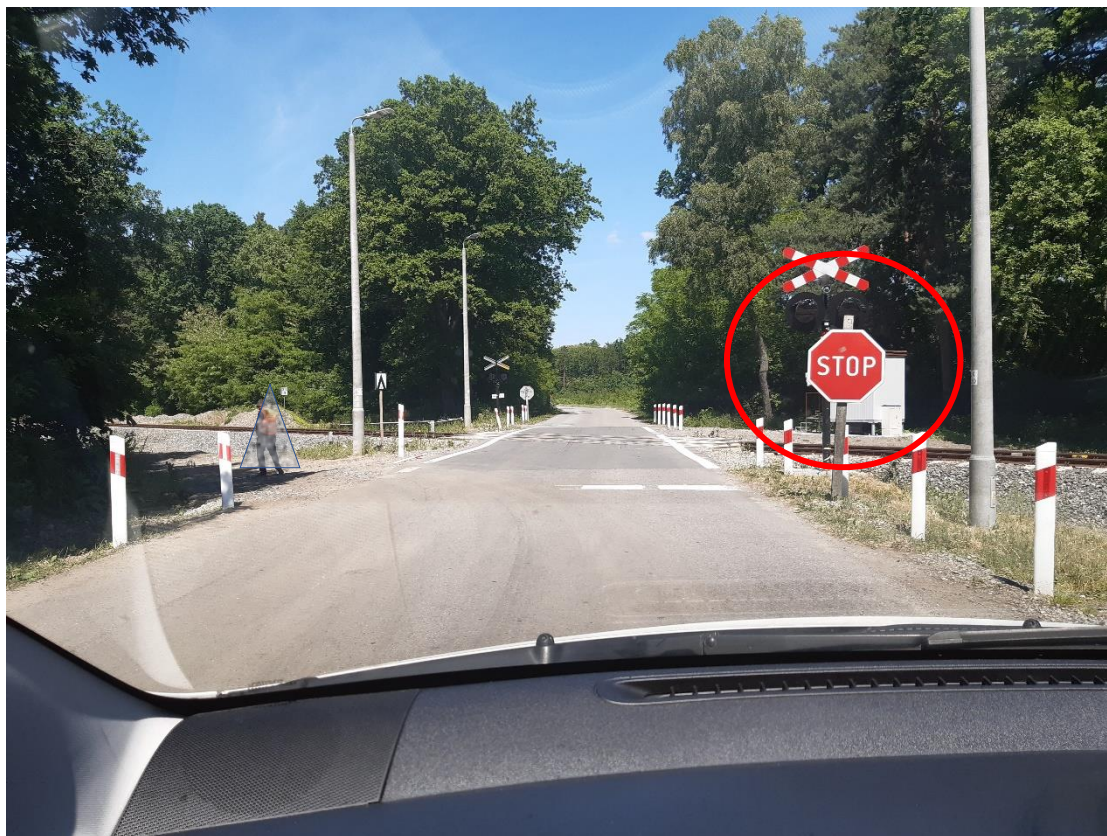
Photograph 8 – Sign B-20 obscuring the “signalling out of order” sign

The required minimum visibility of the level crossing from the access road is 120 metres (undeveloped area). The actual visibility of the level crossing from the road is: