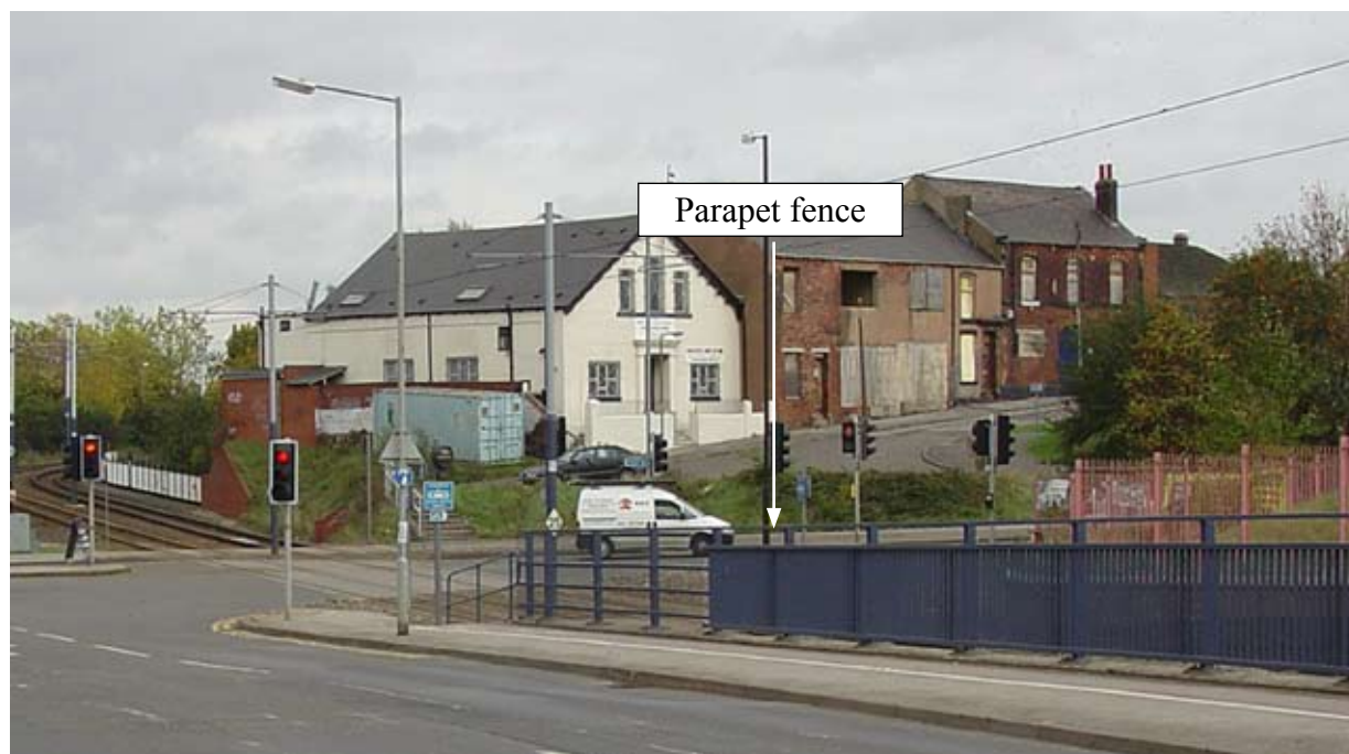
Figure 2: Parapet fence