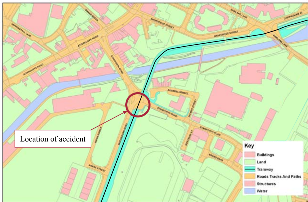
Extract from OS map of central Sheffield showing location of accident