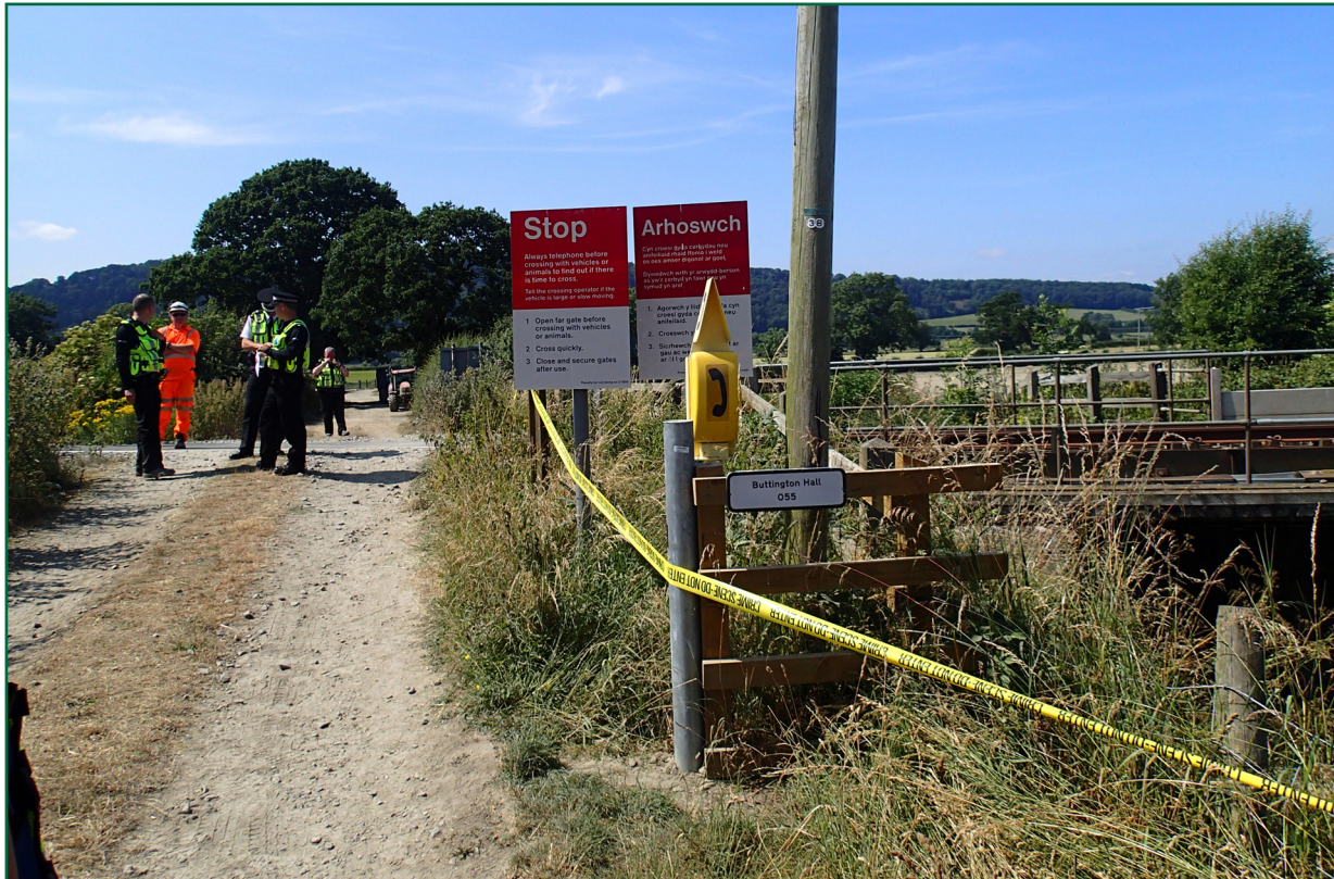
Figure 4: Buttington Hall crossing, looking in the direction that the tractor was travelling, showing the signs and telephone