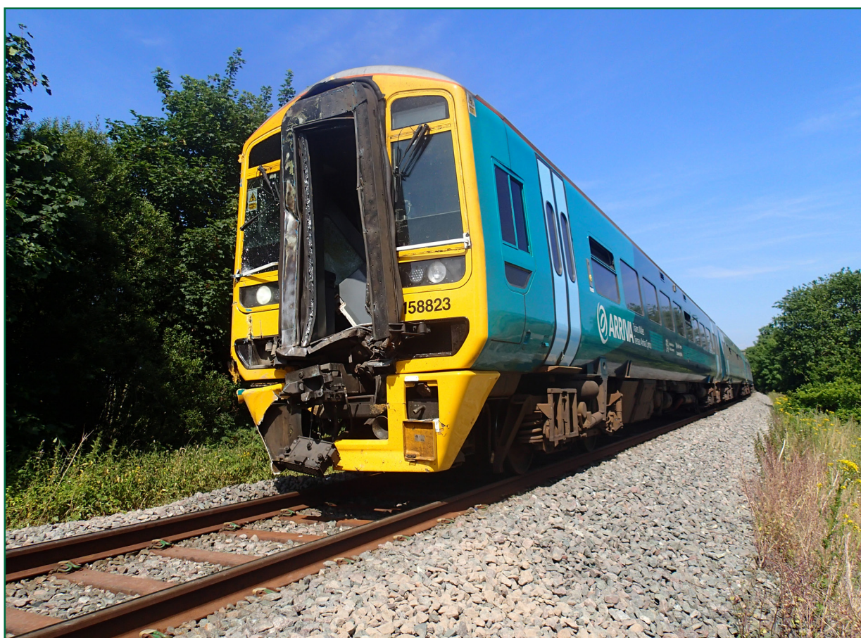
Figure 3: The front of the train involved