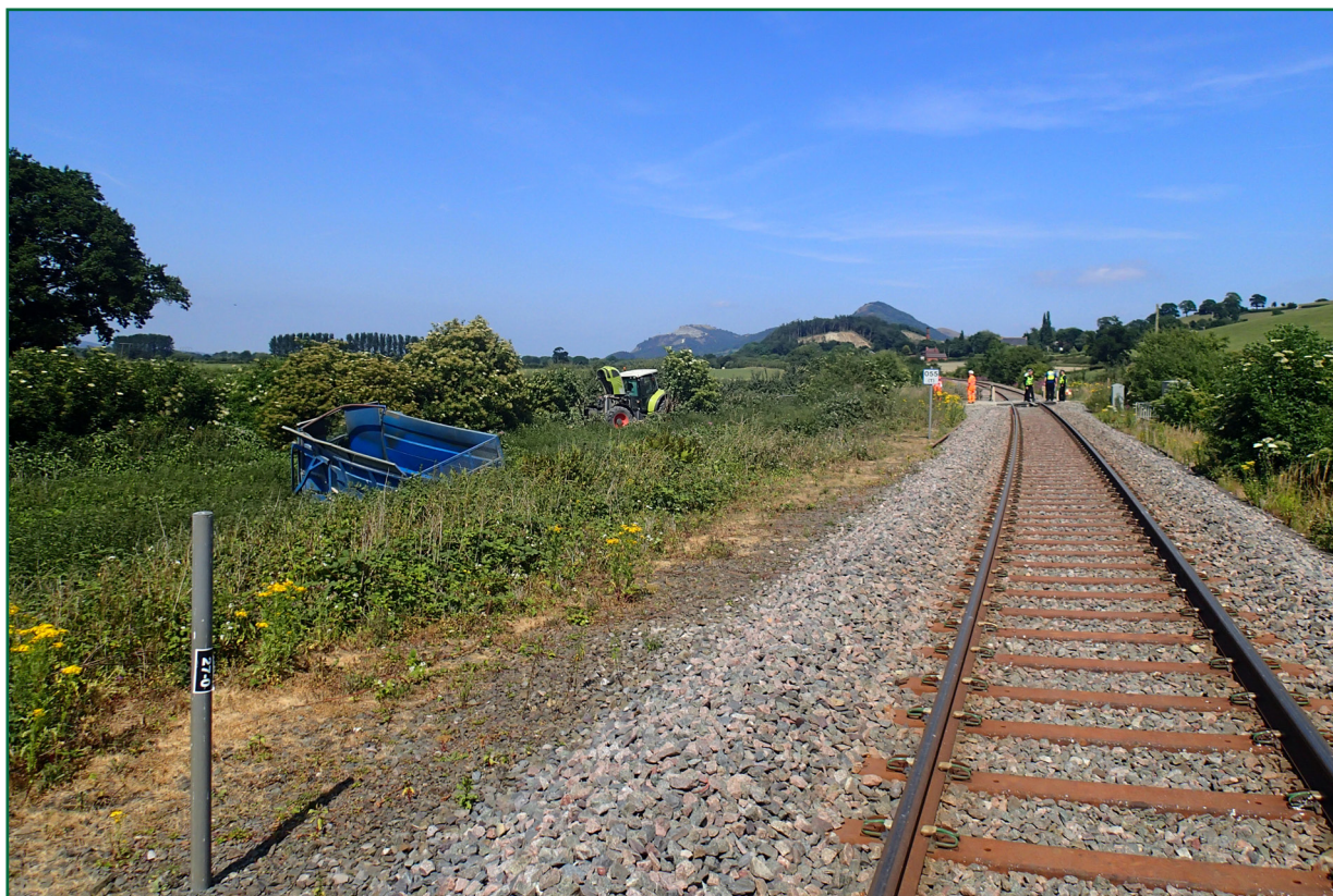
Figure 2: Buttington Hall crossing, looking towards the Shrewsbury direction showing the tractor and trailer in their post-accident positions