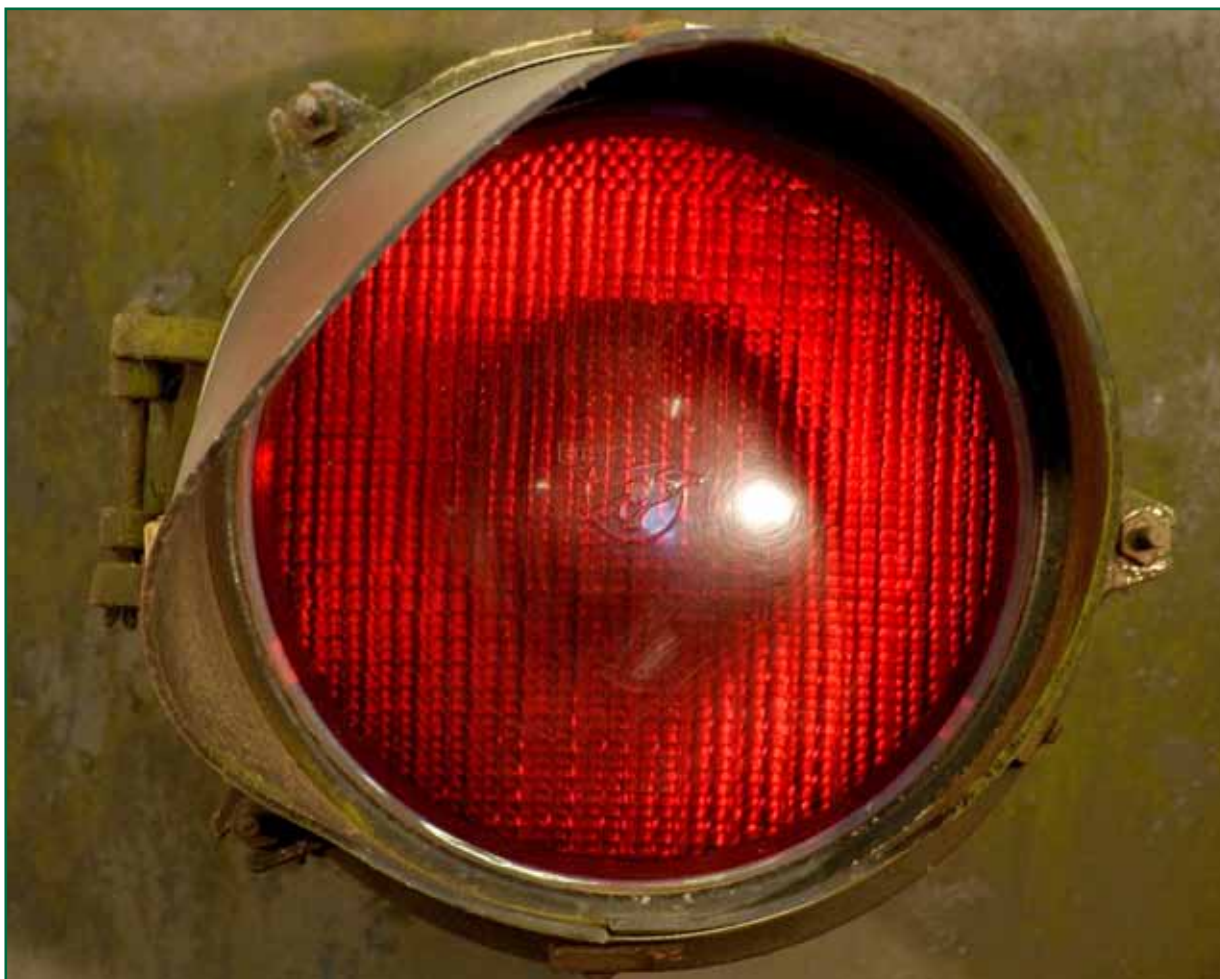
Figure 5: Close up of 'Bliss' lens fitted to one of the wig-wag units at the north side of the crossing