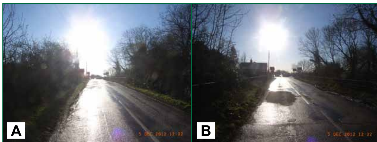
Figure 4: The approach to the crossing in similar conditions at the same time of day on the day after the accident – (a) shows the view from 62 metres and (b) shows the view from 45 metres away

43 The crossing barrier was down, with the boom lamps lit and the wig-wag lights were flashing when the photographs of the approach were taken. The optical response of the camera may not match that of the human eye, however the photographs match the observations made by the RAIB inspector who was accompanied by several observers from Network Rail. That the crossing was activated was not readily apparent to any of those present when viewing the crossing from a range of distances between 129 metres and 45 metres. The wig-wag lamps became more clearly visible at distances closer to the crossing than 45 metres.