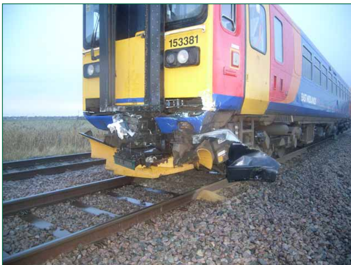
Figure 3: The train involved