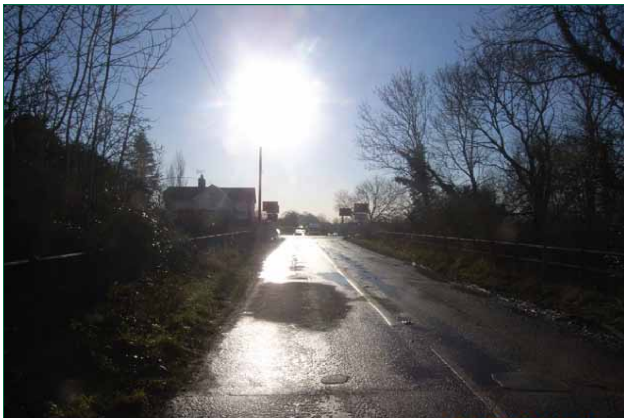
Figure 6: The approach to the crossing as seen from a point 45 metres back from it