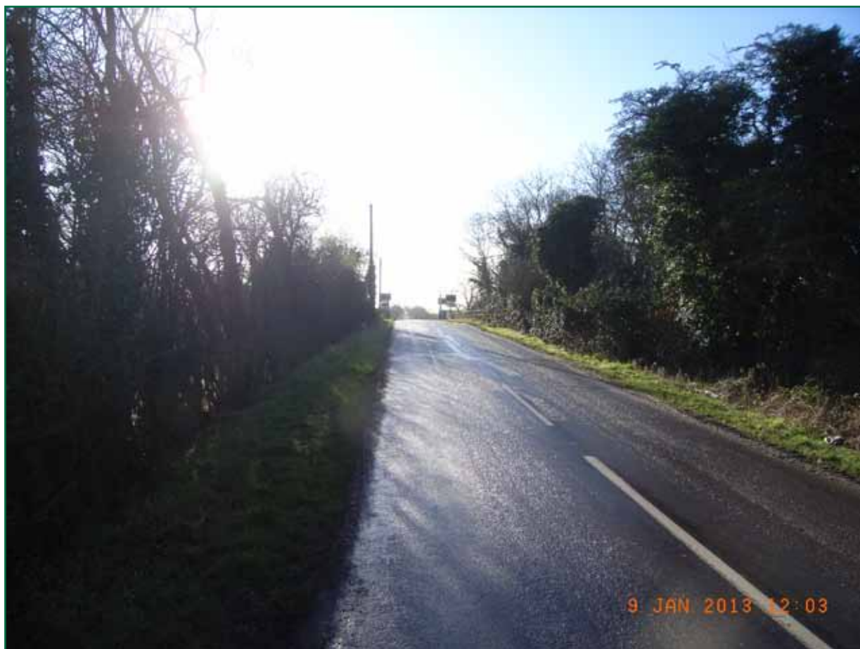
Figure 2: Road approach to Beech Hill AHB crossing