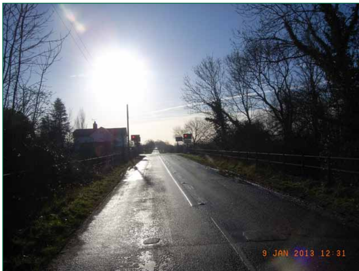
Figure 7: The view from the same point as figure 6, in similar conditions on 13 January 2013, with standard LED wig-wag light units

120 Network Rail issued guidance to its signalling maintenance staff and level crossing inspector maintainers on the risk of wig-wag signals being affected by sunlight (Network Rail Noticeboard item NB 122, 18 February 2013). The notice described how the sun could affect a road user's ability to see the red lights when shining from behind the wig-wags (as at Beech Hill) or from behind the observer (as at Wraysholme and Halkirk). The remedial action suggested was to fit longer hoods to the lamp units. This would only be an effective remedy in situations where the sun is shining from behind the observer. No effective advice was given on how to deal with situations where the sun is shining from behind the wig-wags towards the observer.