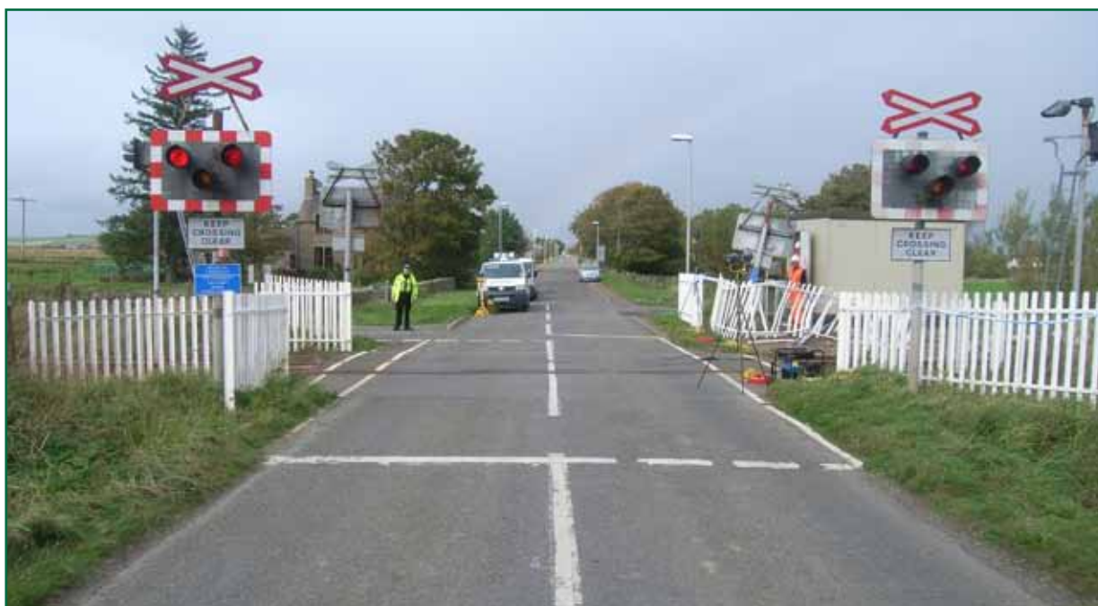
Figure 3: Halkirk level crossing from the south