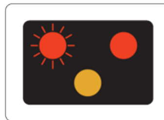
Figure 5: Signal details extracted from the Highway Code

At level crossings, lifting bridges, airfields, fire stations, etc.