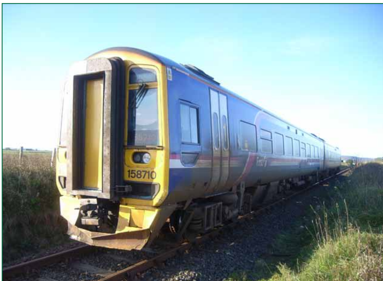
Figure 6: The train involved in the collision at Halkirk level crossing