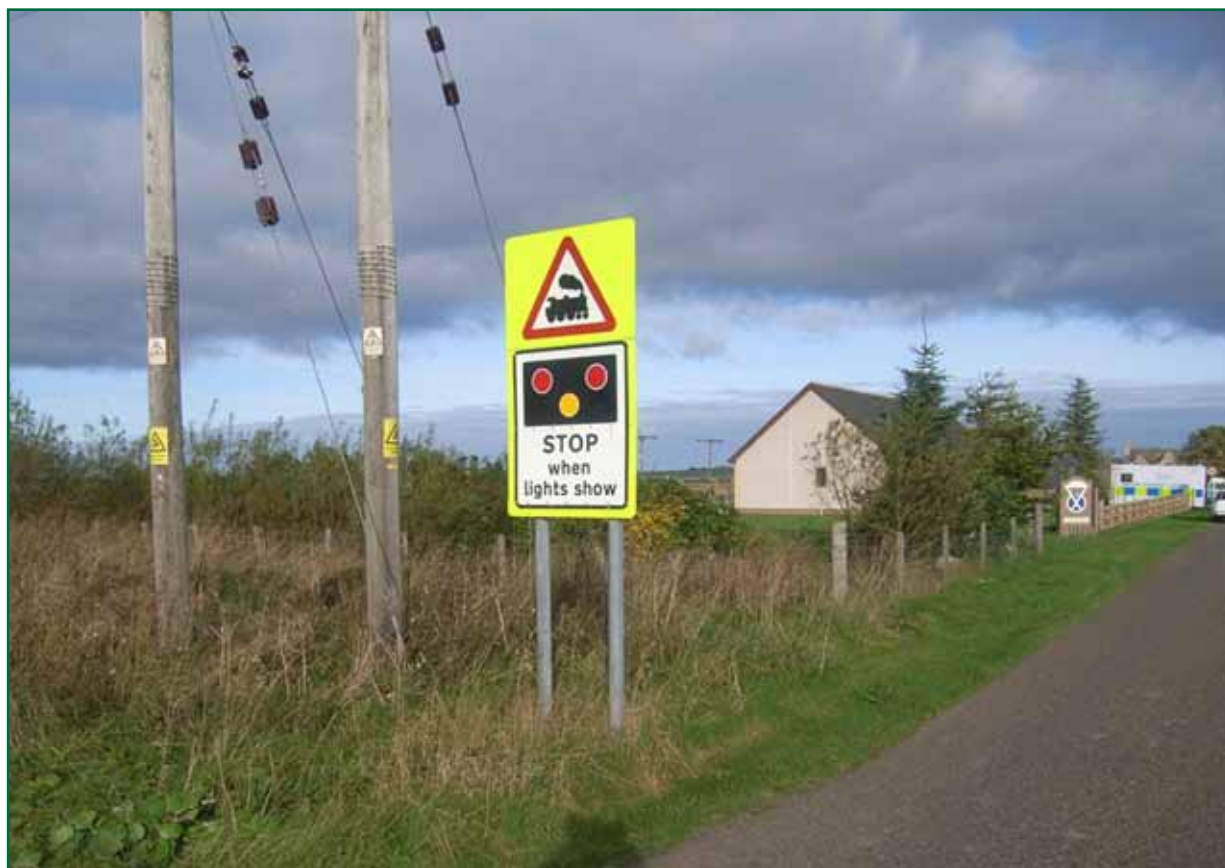
Figure 4: Signage on the approach to Halkirk level crossing