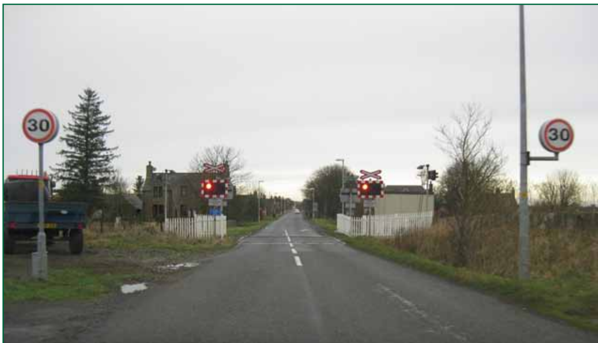
Figure 9: the 30 mph signs at Halkirk crossing (taken after the accident and the renewal of the road lights to the LED type)