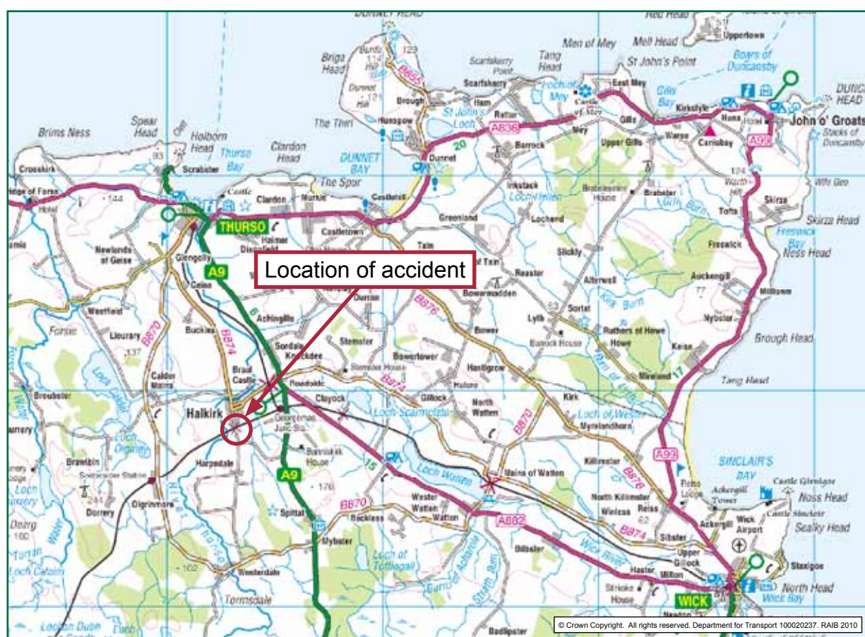
Figure 1: Extract from Ordnance Survey map showing location of accident