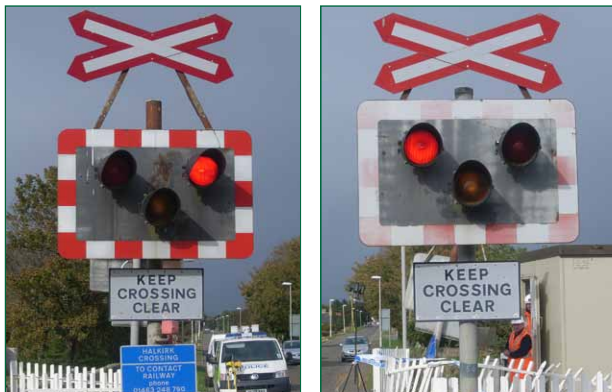
Figure 7: Condition of road traffic light signals, Halkirk crossing, south side