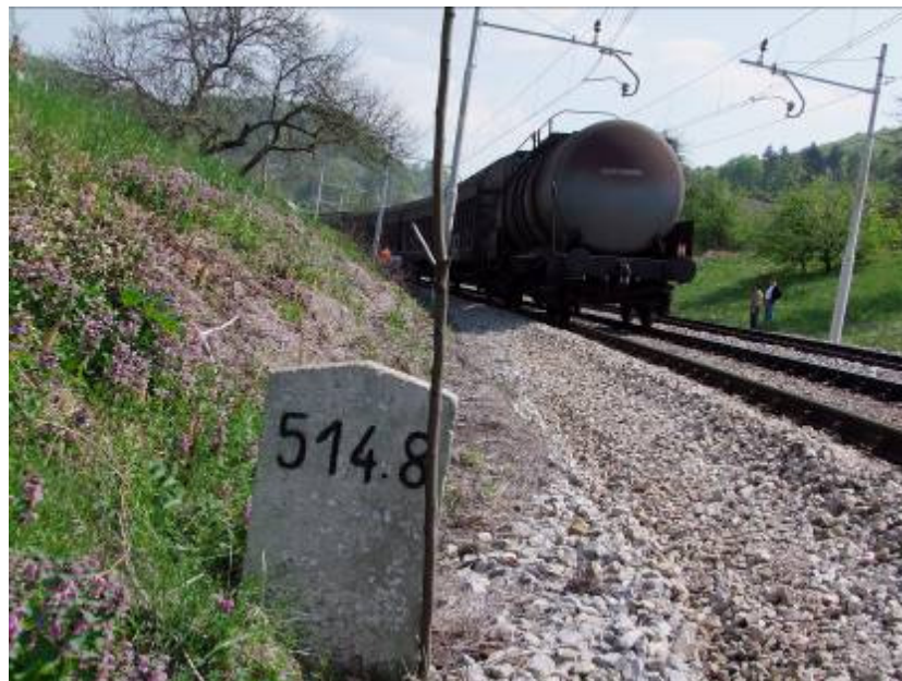
Figure 3: The rear of stopped train no 52102 located at km 514+848

Staying, and in particular, moving about in the railway and track danger zone calls for particular caution to be exercised by any individual who finds himself on such a location. First and foremost, all relevant sense organs must be on the alert during the movements in the danger zone. The most important, however, is concentration. One has to constantly bear in mind that one is in the railway or track danger zone. It is necessary to have full knowledge of all the dangers one is exposed to when moving about or staying in the danger zone. With his year-long work experience, the rail works manager was undoubtedly well aware of the working conditions and hazards. It is a fact that the cause of such incidents is often excessive self-confidence growing with years of experience, which can be extremely deceptive. It is in human nature not to consider the consequences and to go against the rules, thinking that they are unnecessary.