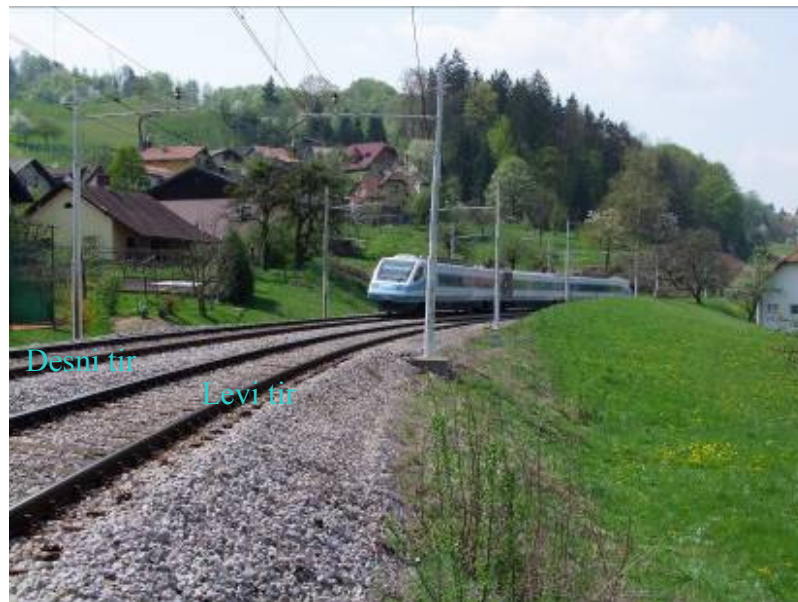
Figure 4: Layout of the terrain at the left-hand track in the area where the rail works manager was walking in the left-hand track

One of the reasons for the rail works manager’s walk in the very track of this section may also have been the fact that it was difficult to walk next to the track because of the rising ground continuing immediately under the railway ballast and because of the drainage duct for rainwater.