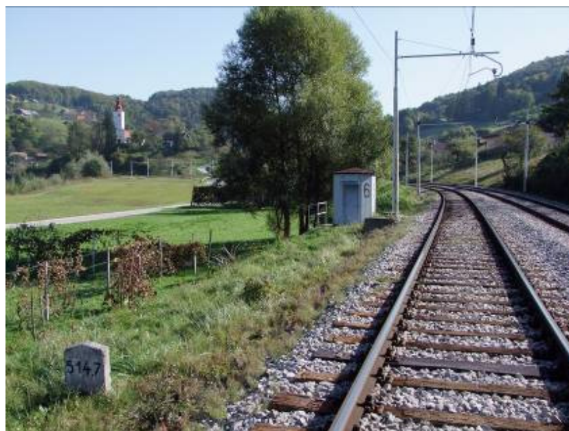
Figure 2: Reduced visibility on the left-hand railway track, 230 m before the accident site

When walking from one work-site to another, workers must avoid crossing the tracks, in particular when visibility is poor.