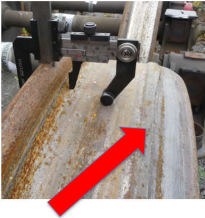
Extraordinary wheel tread deformation on the outer side of the tread

The measurement tool is not part of the assessment