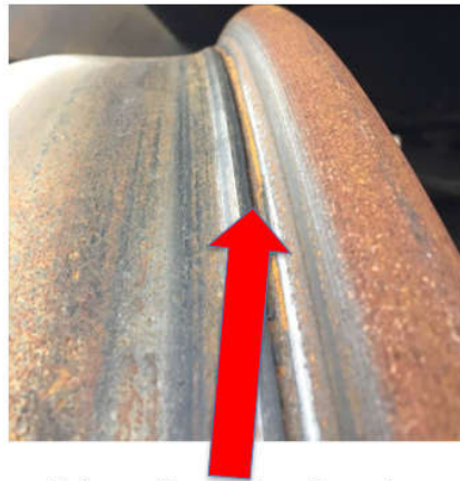
Extraordinary wheel tread deformation near the flange

The measurement tool is not part of the assessment