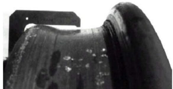
Figure C.14 — Picture of false flange