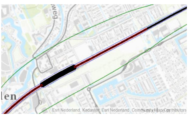
Example of risk contour mapping