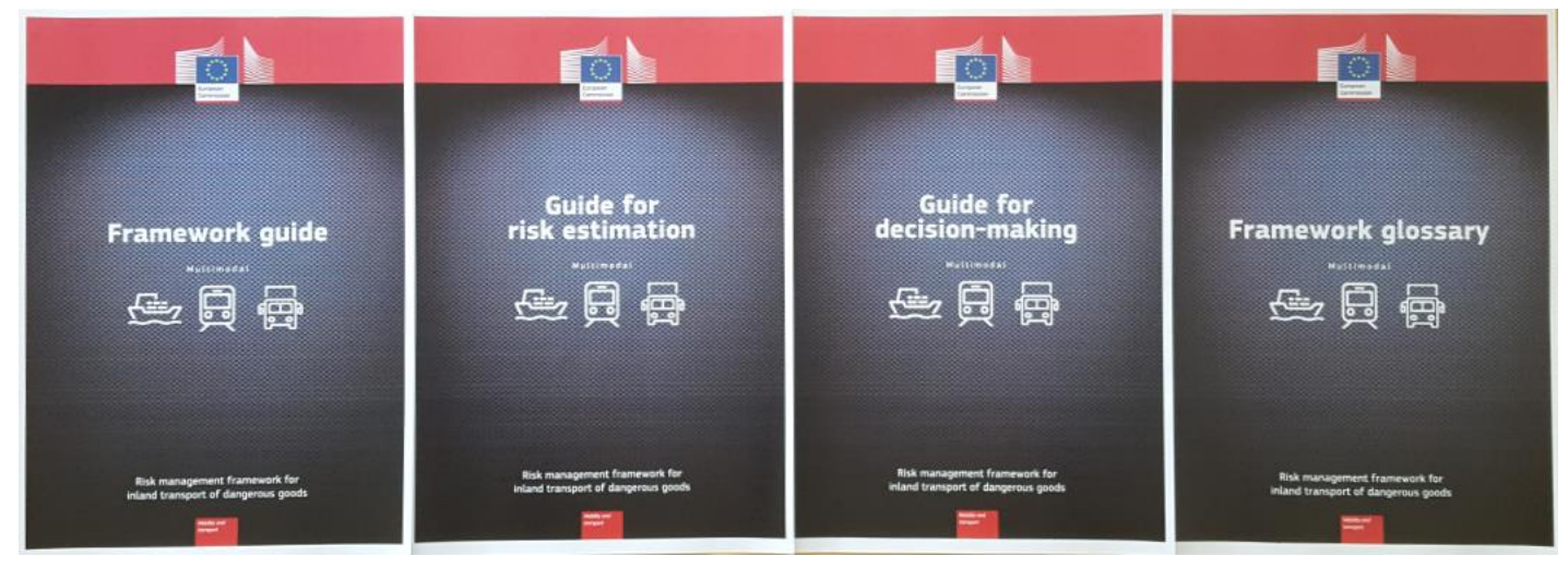
Harmonised Risk Management Framework for Inland TDG operations

The transport complying with these legal provisions is authorised for international and domestic journeys on the inland transport networks, combining all types of transport services, and crossing various landscapes and cities.