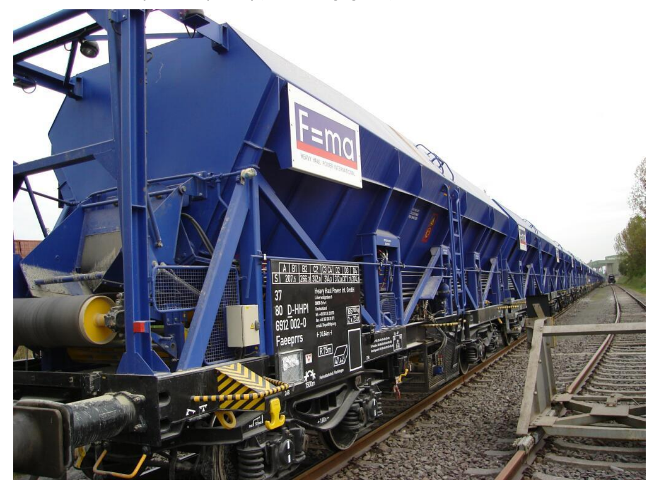
Figure 7: Example 1 of a unit consisting of separate rail bogies connected to compatible road vehicles

Figure 6: Example 3 of a unit consisting of a rake of permanently connected elements, those elements cannot be operated separately (self-discharging train)