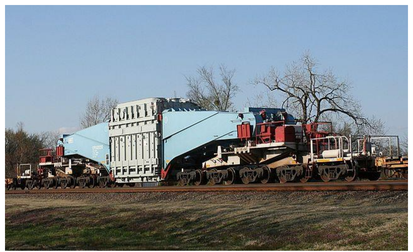
Figure 2: Two examples of vehicles that increase their length in loaded configuration and their payload is part of the vehicle structure (in unloaded configuration)

Figure 1: Example of a vehicle that increases its length in loaded configuration and its payload is part of the vehicle structure (in loaded configuration)