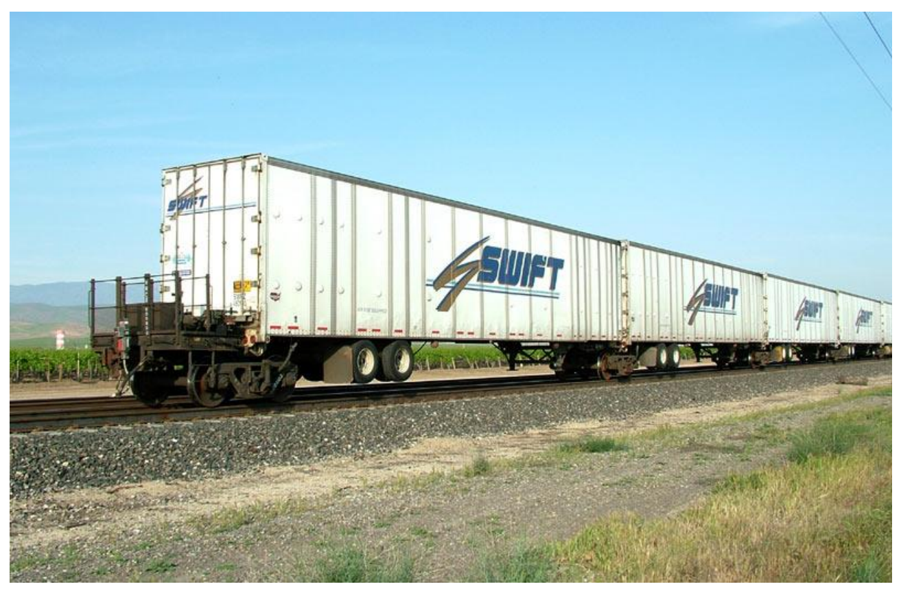
Figure 8: Example 2 of a unit consisting of separate rail bogies connected to compatible road vehicles