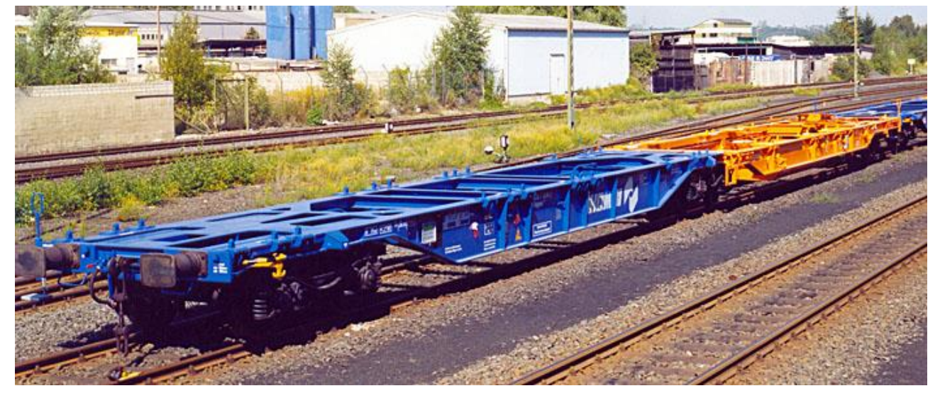
Figure 5: Example 2 of a unit consisting of a rake of permanently connected two elements; those elements cannot be operated separately

Figure 4: Example 1 of a unit consisting of a rake of permanently connected two elements (blue and orange), those elements cannot be operated separately (articulated wagon)