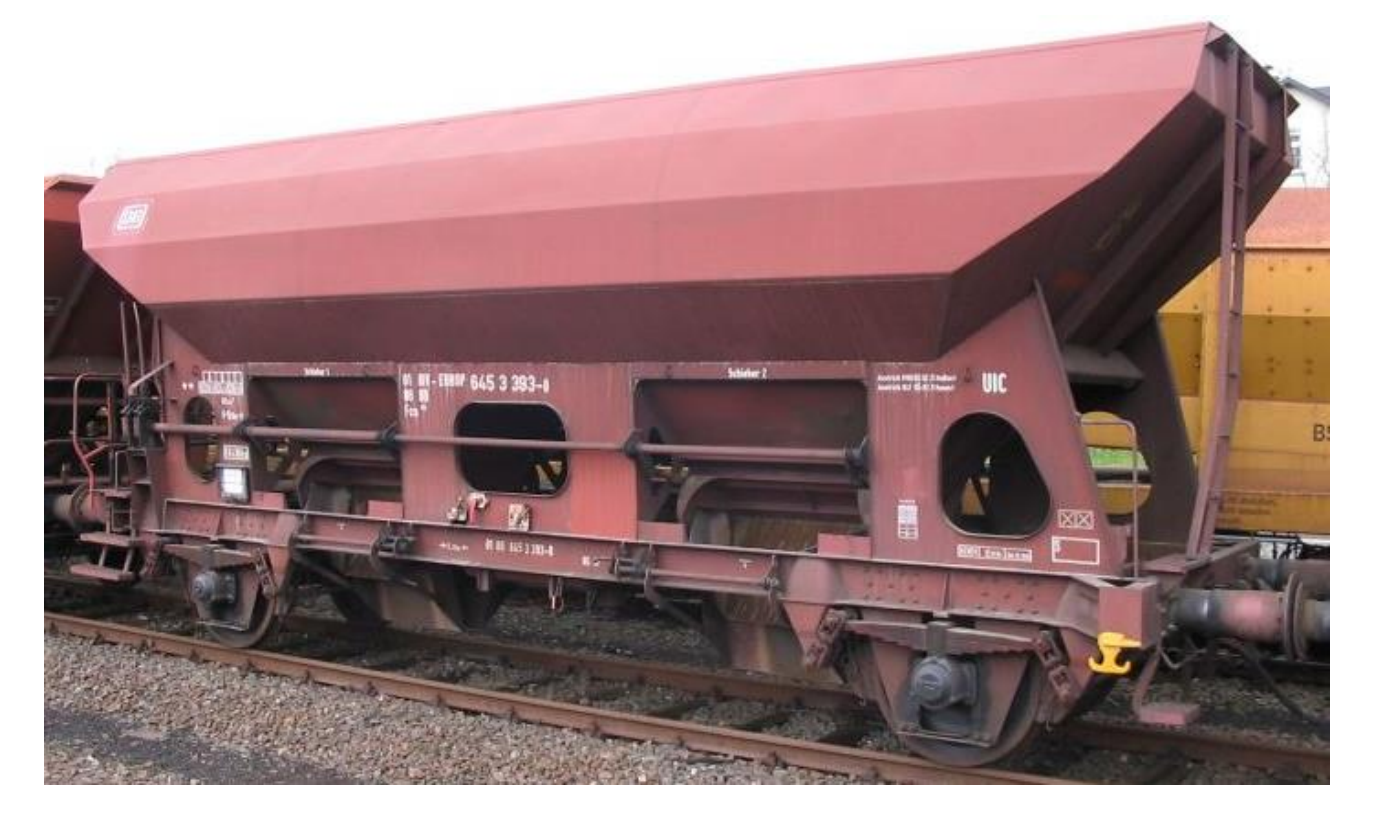
Figure 3: Example of a unit consisting of a (freight) wagon that can be operated separately, featuring an individual frame mounted on its own set of wheels

The following Figures 3, 4, 5, 6, 7 and 8 clarify these definitions.