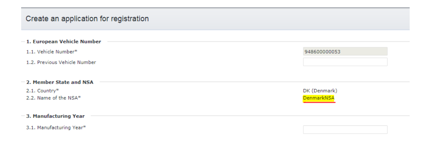
Figure 1 – Create an application for registration – Country and Name of the NSA automatically prefilled in by the sNVR software

This does not allow to introduce the corresponding EVR parameter, parameter 11.1 "Name of authorising entity".