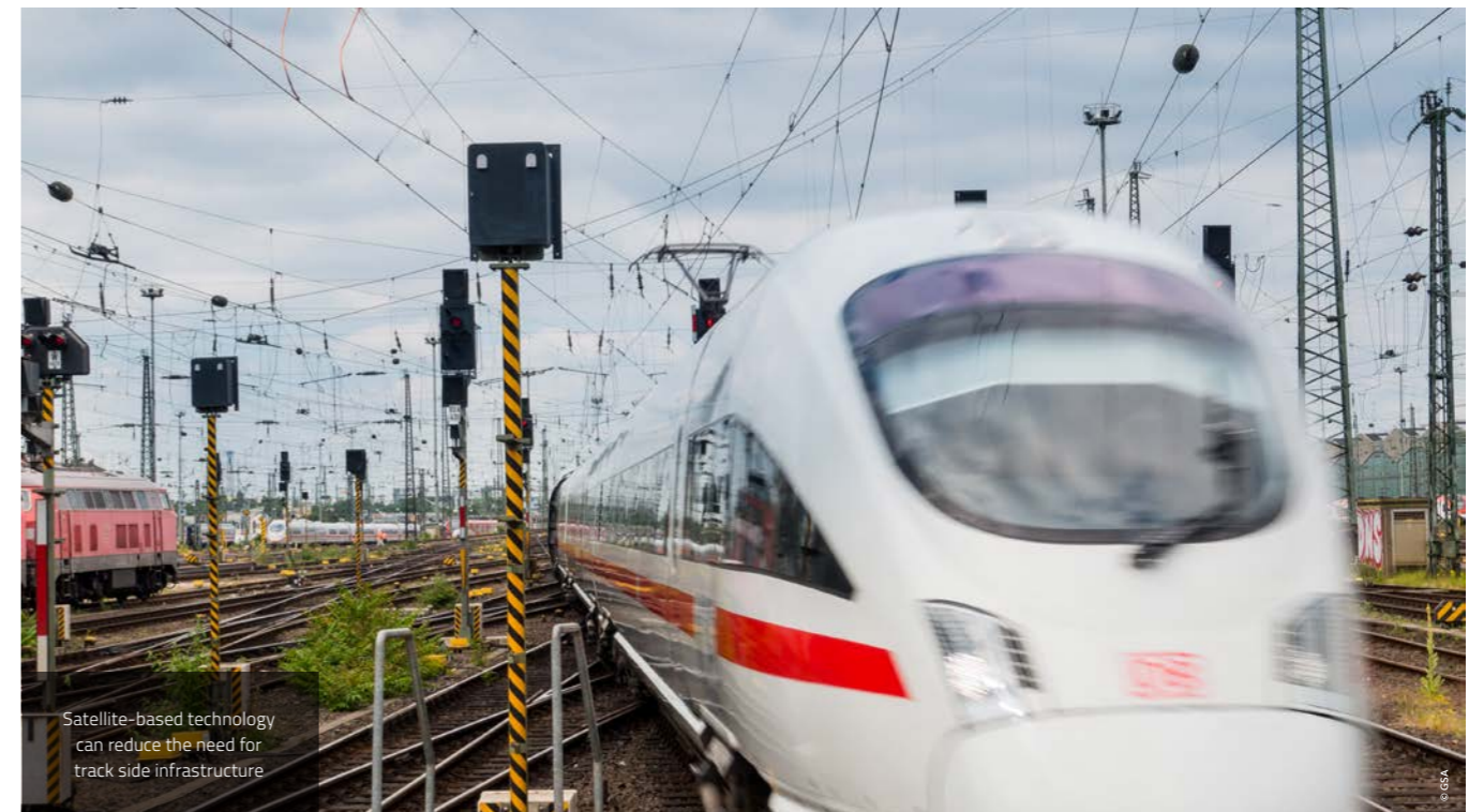
Satellite-based technology can reduce the need for track side infrastructure

Satellite-based technologies will shape the future of European and global railways. While many traditional rail technologies will be gradually phased out, satellite technology opens up new possibilities to facilitate and accelerate the digitalisation of rail – providing scalable solutions for accurate railway positioning, which is essential for safety, as well as improving the user experience for passenger and freight customers. This article explores how the introduction of global navigation satellite system (GNSS) positioning technologies will make rail infrastructure more cost efficient and give a further boost to the global success story of exporting European railway signalling technology.