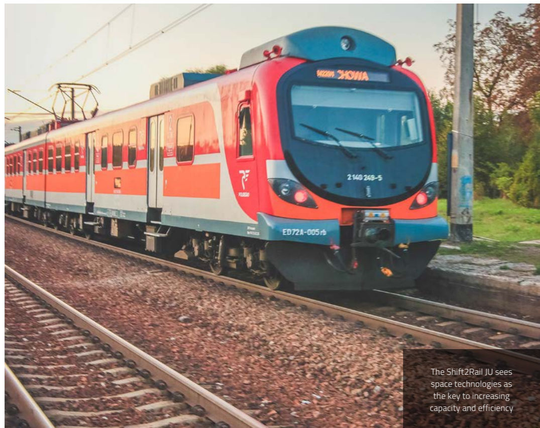
The Shift2Rail JU sees space technologies as the key to increasing capacity and efficiency