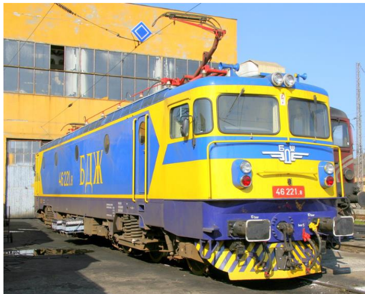
7th ERA TAF TSI Regional Workshop (Romania, Bulgaria, Greece)