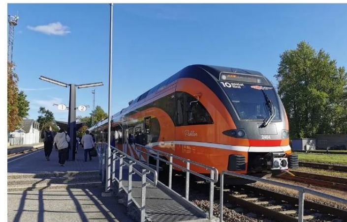
An Elron train in Narva.

A wave of Distributed Denial-of-Service (DDoS) attacks thought to have been the work of pro-Russia hackers and which brought the ticketing service of rail provider Elron have been foiled, and normal service has resumed.