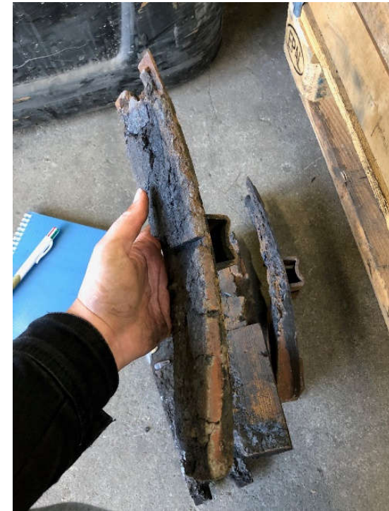
Carbonized brake block