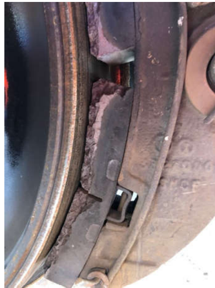
Change of color and broken out brake block material