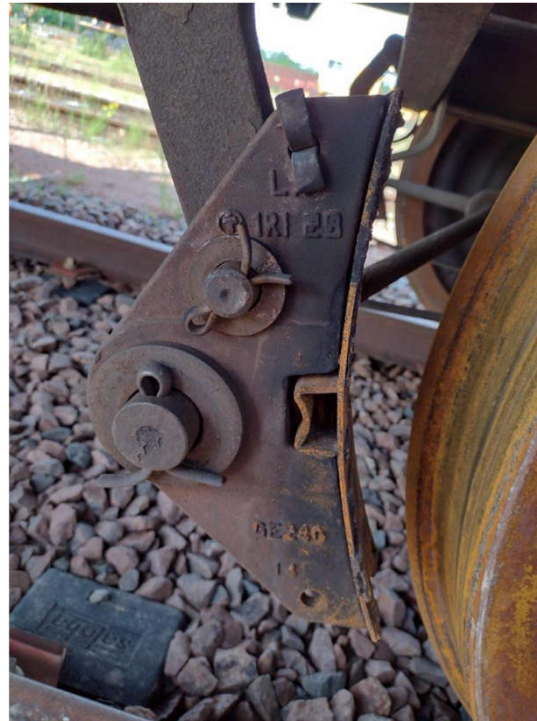
Fused brake block