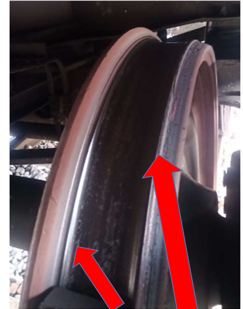
Extraordinary wheel tread deformation on the outer side of the tread and near the flange